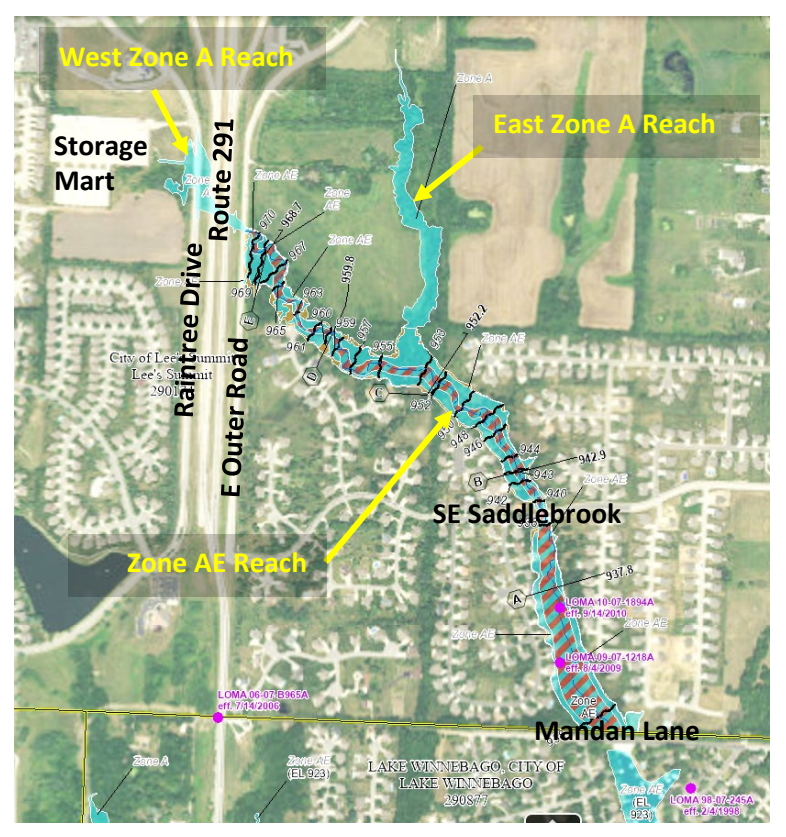
FEMA National Flood Hazard Layer (NFHL) illustrating existing Zone A, Zone AE and LOMAs