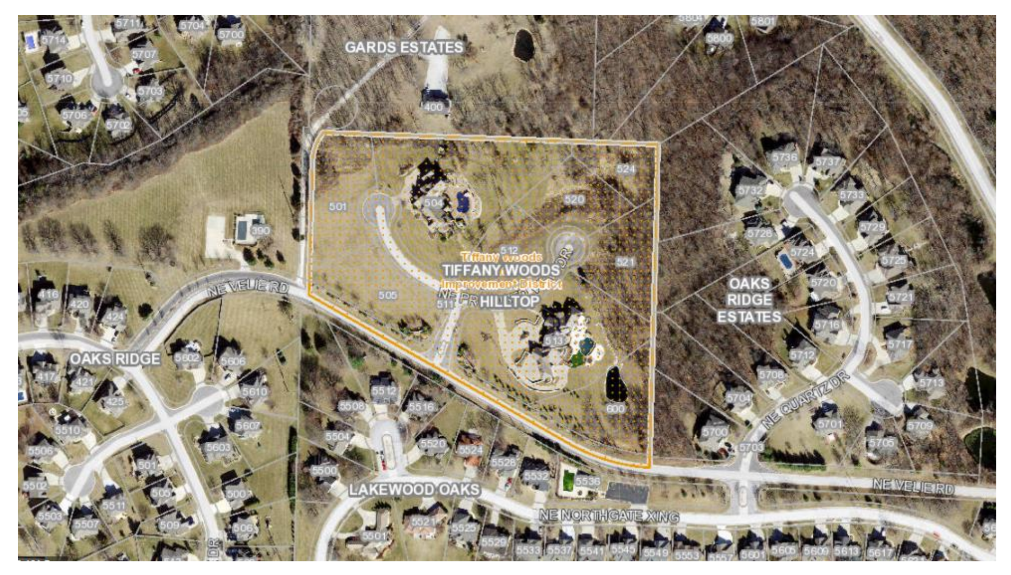
Tiffany Woods CID – low pressure sewer system for residential subdivision