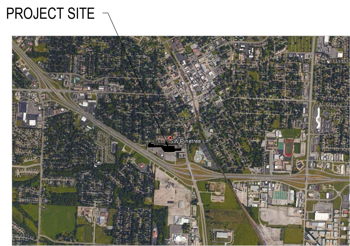
VICINITY MAP - NOT TO SCALE

CURRENT PARKING LAYOUT: 4.48 CARS / 1000 SF PROPOSED PARKING LAYOUT: 4.41 CARS / 1000 SF