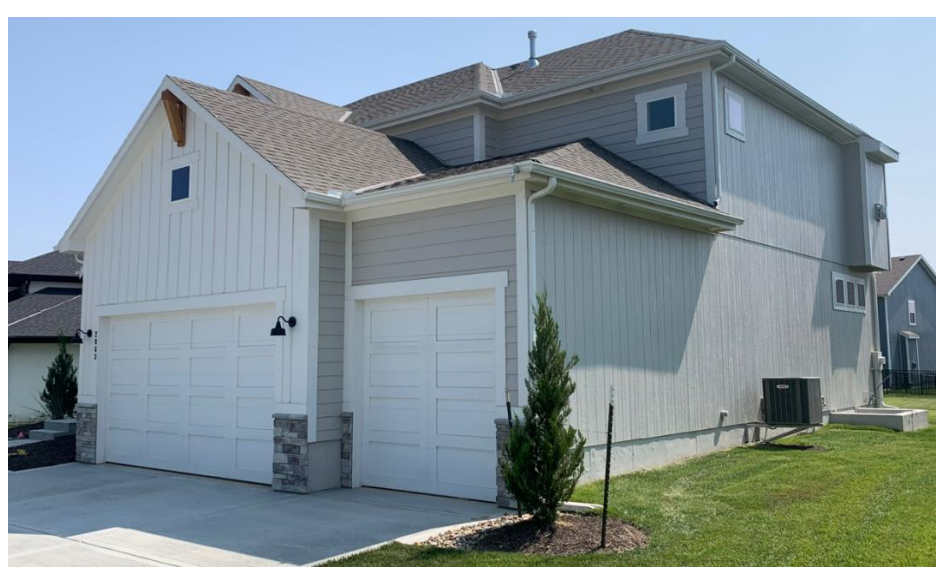
Figures 1 and 1 - Residence in Woodside Ridge with LP SmartSide board and batten and lap siding on front elevation and LP SmartSide panel on side elevation.