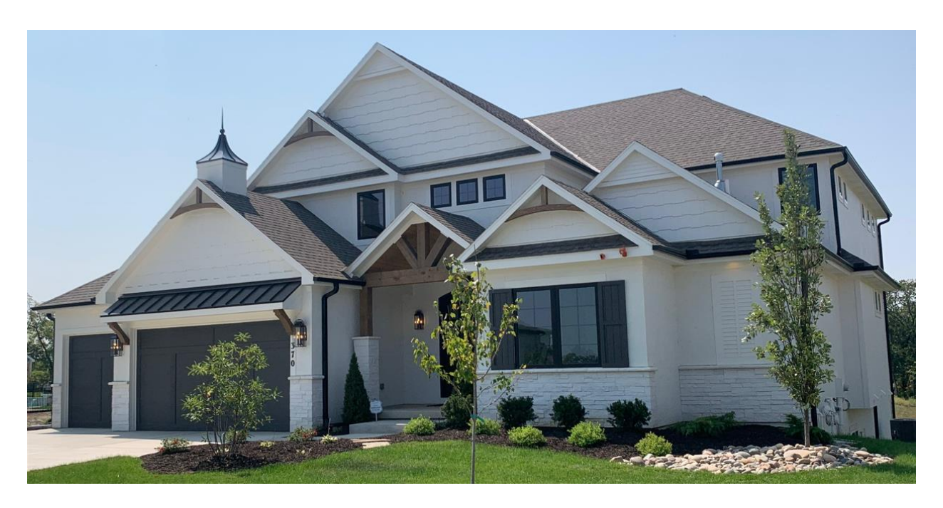
Figure 2 - Residence in Woodside Ridge with LP SmartSide shake siding on front elevation and LP SmartSide panel on side elevation.