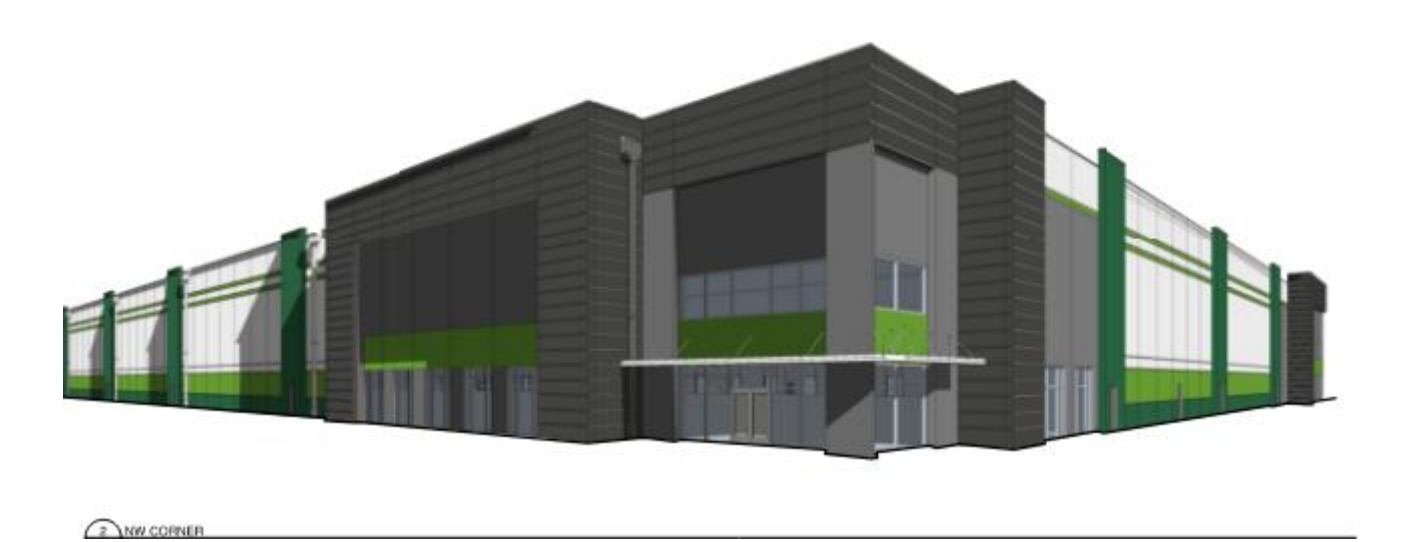
Figure 2 - Renderings of NE and NW perspectives