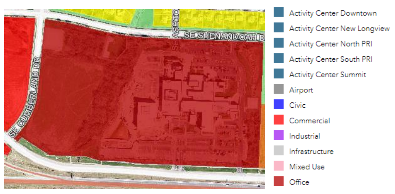
Figure 3 - Ignite Comprehensive Plan

The proposed use is consistent with the Office land use designation under the Ignite Comprehensive Plan, which encompasses a range of office types that include medical-related uses. The proposed use supports identified objectives under the comprehensive plan by increasing available medical services to serve the community and developing long-vacant commercially-zoned property.