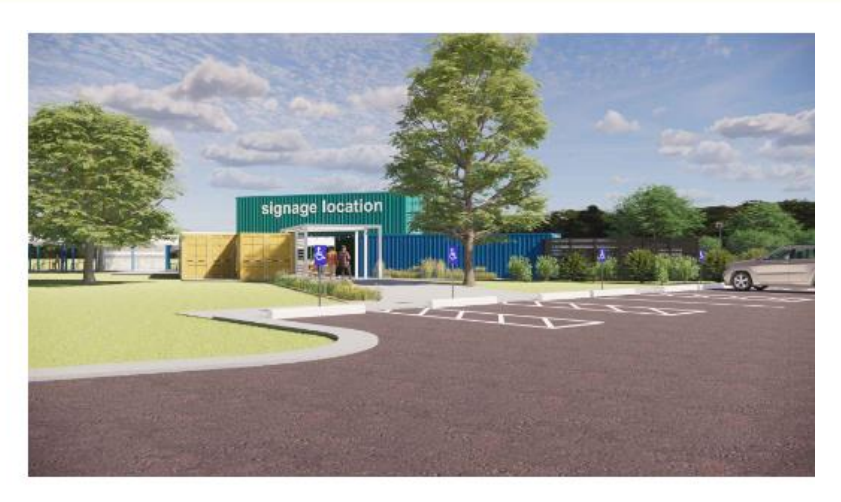
2 EXTERIOR RENDERING