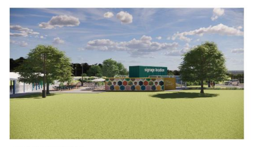
4 EXTERIOR RENDERING