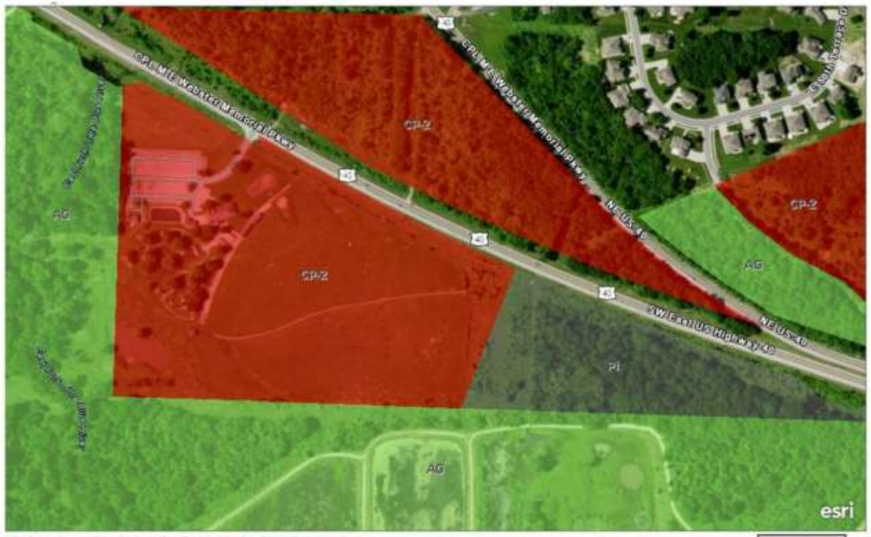
Displays the zoning designation for properties in Lee's Summit, MO