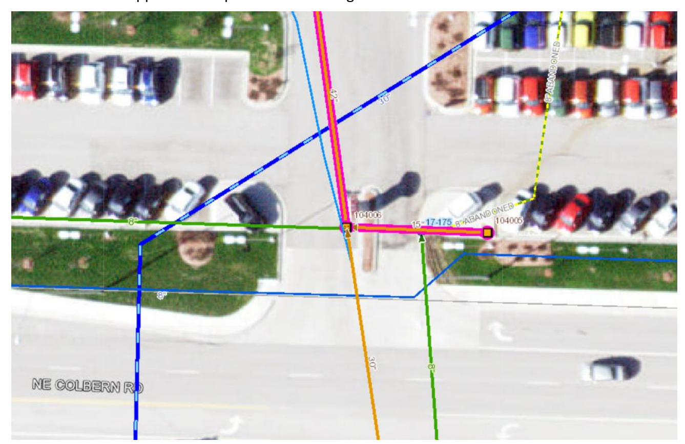
Figure 1 - NE Colbern Rd driveway entrance (showing existing area public utility lines)

As it relates to the presence of utility lines and/or utility easements, the primary driveway entrance along NE Colbern Rd sits in an area impacted by the presence of a number of utility lines and easements. Multiple water lines, sanitary sewer lines and storm water lines traverse the immediate area. This directly impacts where a monument sign can be placed so as not to obstruct access to said lines or to compromise the integrity of the utility lines by constructing a structure on top of or within close proximity to said utility lines. The presence of the utility lines and westbound turn lane into the site required the existing monument sign location to be pushed further back into the site to avoid conflicts with the lines and sight distance for cars exiting the site. The fact that the monument sign location is pushed further north into the site does impact the sign's visibility along NE Colbern Rd and is the basis for the applicant's request for a taller sign at this location.