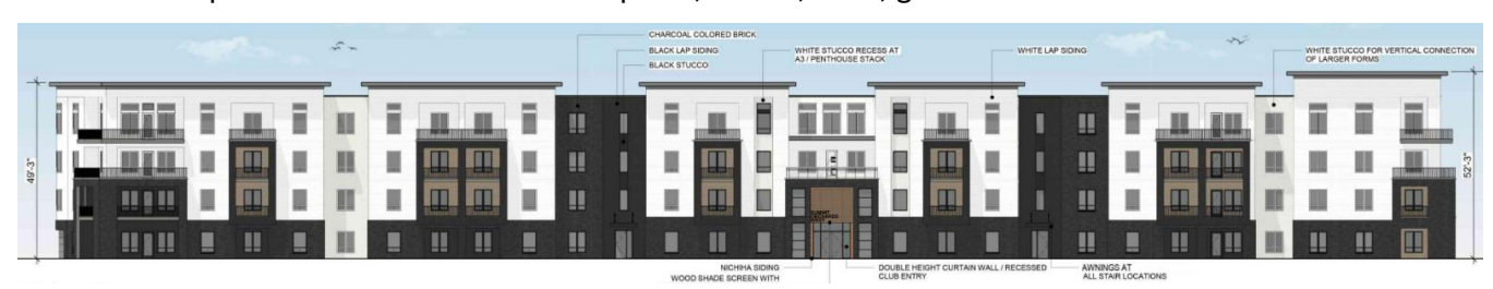
Figure 3 – Multi-family (front elevation)

From an aesthetic standpoint, the proposed development will complement the existing architectural styles and material palette found in the existing Summit Orchards development. The proposed industrial uses will complement the existing Summit Technology campus, but will be more closely associated with an updated design and material aesthetic to complement the nearby Summit Innovation Center. The material palette for the development includes: cementitious panel, stucco, brick, glass and architectural metal.