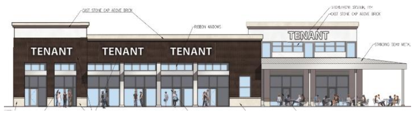
Figure 5- Commercial (front elevation)