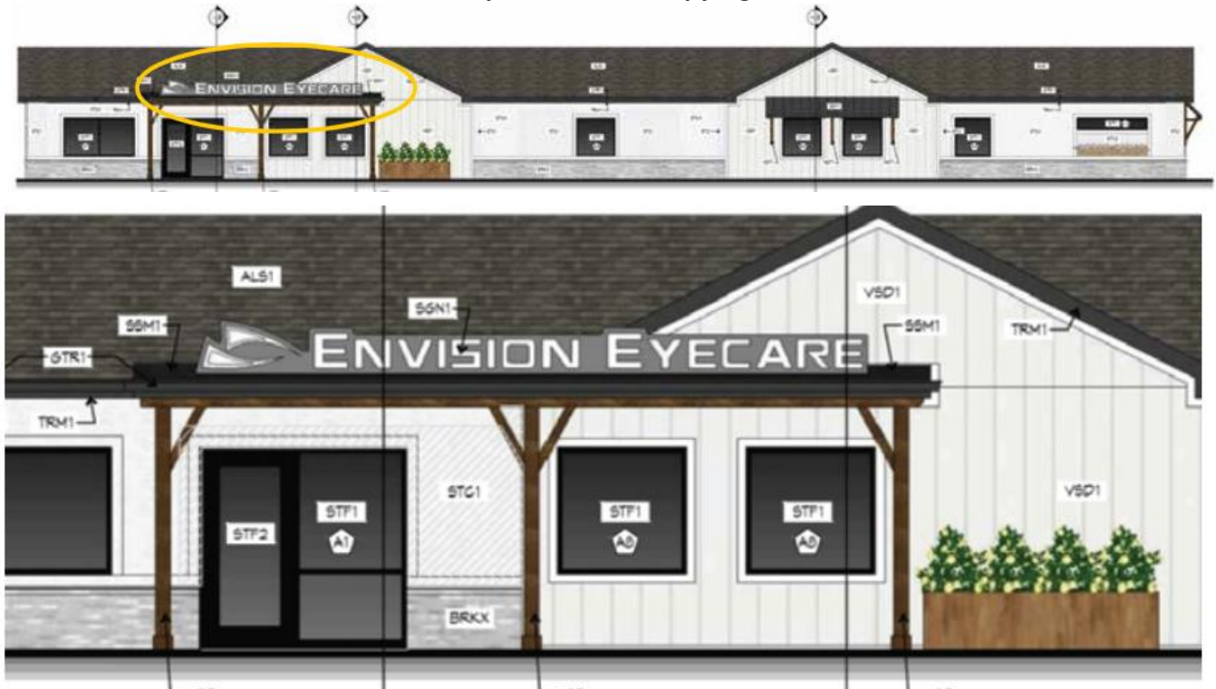
Figure 1 - Top image -- south elevation; bottom image – Blow up of the proposed sign on the south elevation