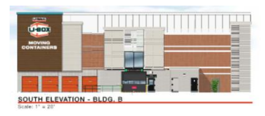
Figure 3 - U-Box Building (non-climate-controlled)