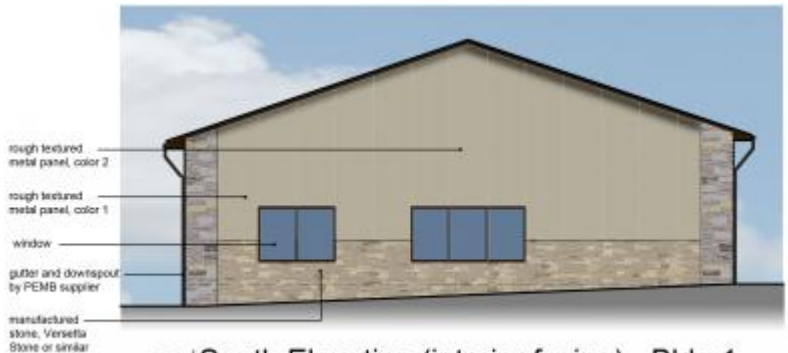
8 | South Elevation (interior facing) - Bldg 1