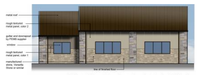
6 West Elevation (exterior facing) - Bldg 1