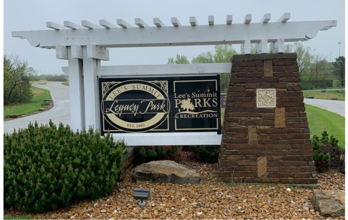
Figure 3 - Existing sign at median entrance of NE Blackwell Pkwy and NE Legacy Park Dr (south drive)