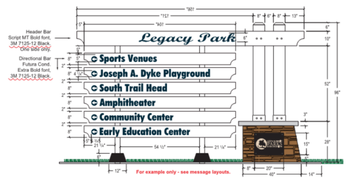
Figure 4 - Typical specification of proposed ground signs

The proposed signs will supplement the existing signs by providing two wayfinding signs at each intersection. NE Blackwell Pkwy is an arterial roadway divided by a landscaped median of varying width. The separation between the northbound and southbound lanes along NE Blackwell Pkwy at the three park entrances are 60' (north entrance) and 180' (middle and south entrances). The two new signs at each intersection will be located on opposite sides of the intersection diagonal from one another—each intended to provide direction for northbound and southbound NE Blackwell Pkwy traffic. The signs are taller, larger and greater in number than the freestanding sign standards allow by right for AG-zoned property.