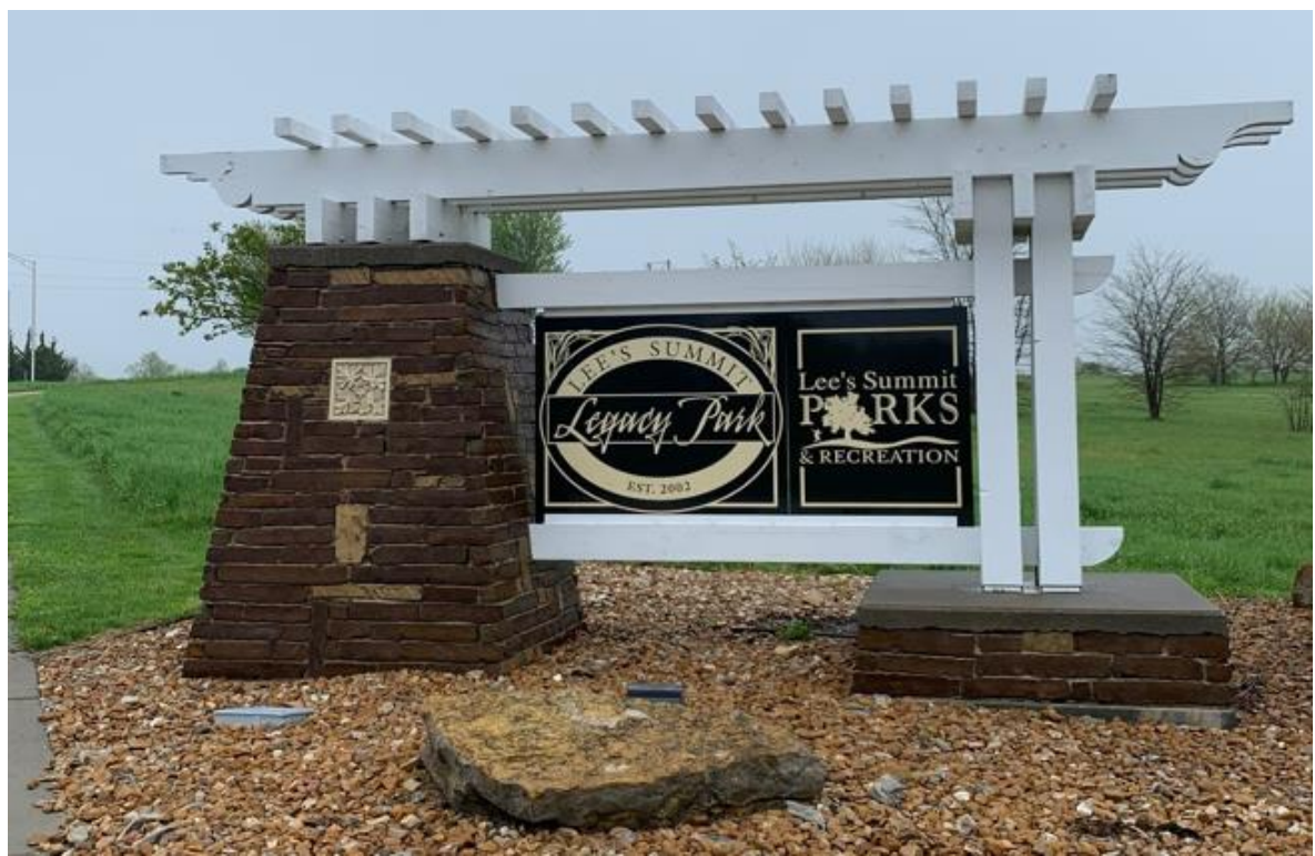
Figure 2 - Existing sign at northeast corner of NE Blackwell Pkwy and NE Legacy Park Dr (middle drive)