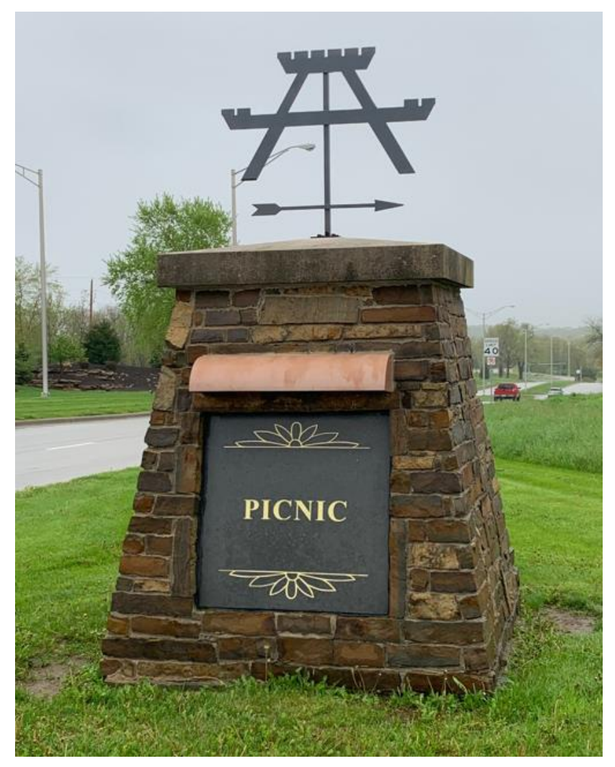
Figure 1 - Existing sign at northeast corner of NE Blackwell Pkwy and NE Coneflower Dr (north drive)

The City of Lee's Summit Parks & Recreation seeks approval of six (6) additional freestanding signs for Legacy Park for the purposes of providing wayfinding for the 692-acre community park. Each of the three park entrances off NE Blackwell Pkwy currently has a single freestanding sign providing general identification of the park, but provide negligible wayfinding information for the various facilities housed within the park.