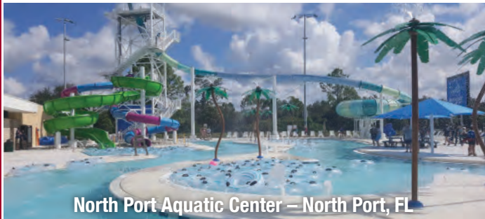
North Port Aquatic Center – North Port, FL