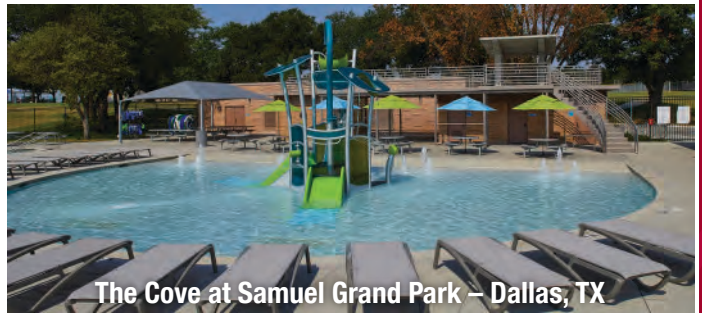
The Cove at Samuel Grand Park – Dallas, TX