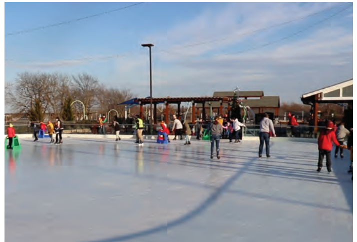
Summit Ice season has skated past the holidays and is still open till we hit warmer temperatures.