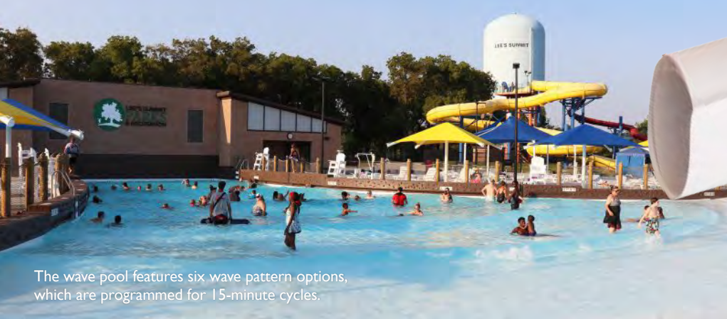
The wave pool features six wave pattern options, which are programmed for 15-minute cycles.

added. The wave generation equipment provides six wave pattern options and are programmed for 15-minute cycles. The addition was designed and equipped with a space for a food truck that will supplement the current food and beverage operation.