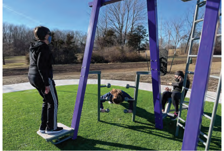
Outdoor fitness classes at Lowenstein Park will now be offered when the weather cooperates.