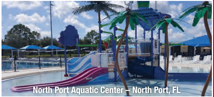
North Port Aquatic Center – North Port, FL