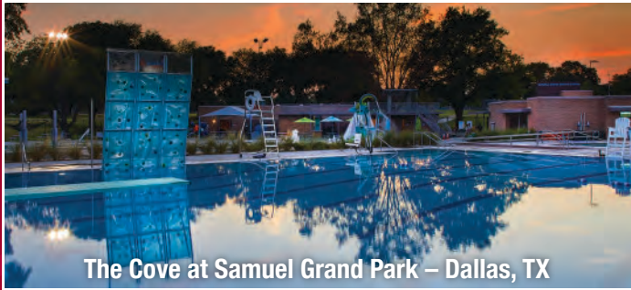
The Cove at Samuel Grand Park – Dallas, TX