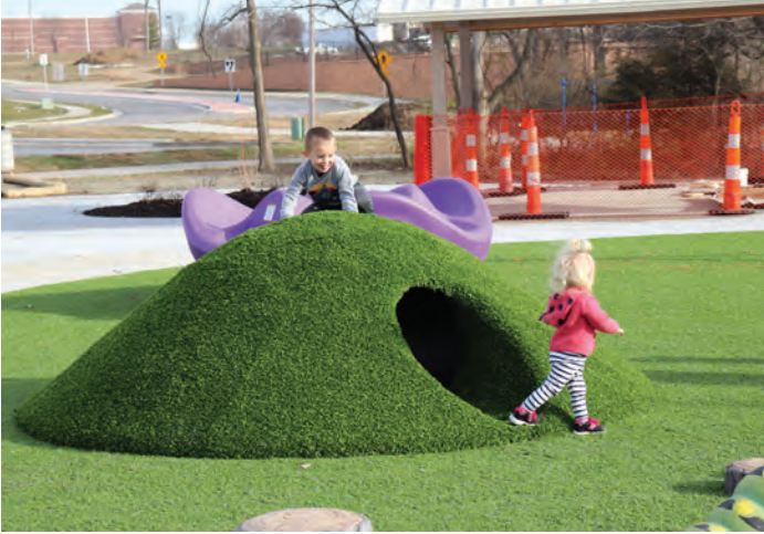
Lowenstein Park Rededication is Saturday, January 23!