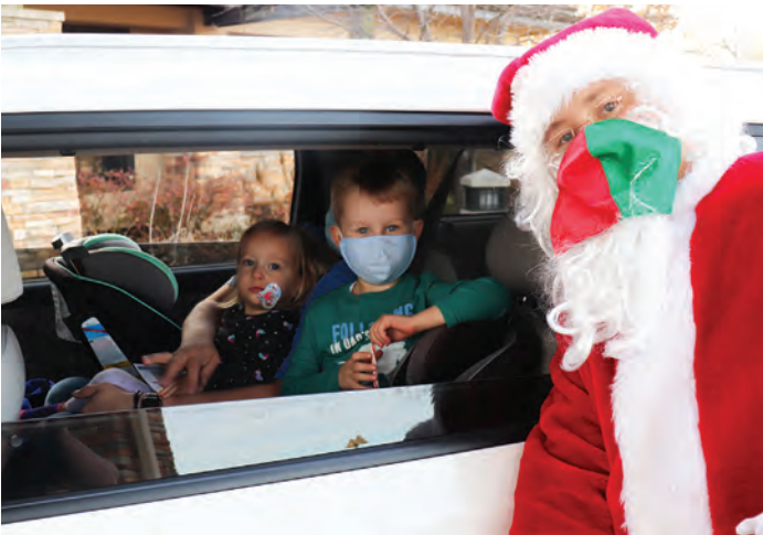
Santa made a visit to our patrons at "Pop-Up Pics with Santa" at Gamber Community Center.