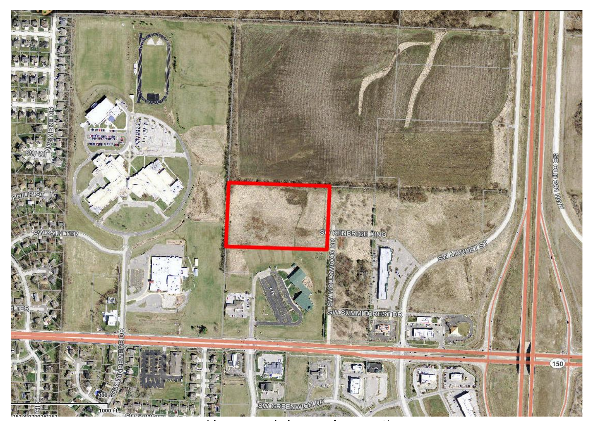
Residences at Echelon Development Site