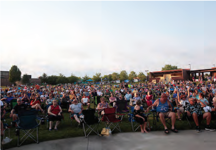
Peace, Love & Music concert was held at the Legacy Park Amphitheater on Saturday, July 17.