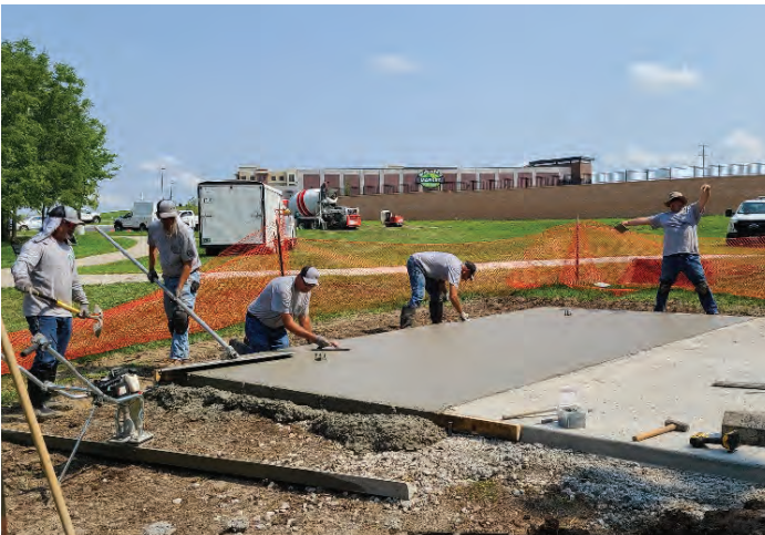
Staff has begun to build shelter #3 at Lowenstein Park.