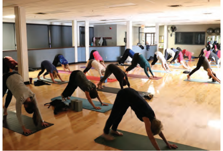
Longview and Lovell Community Centers began opening at 10AM on Sundays.