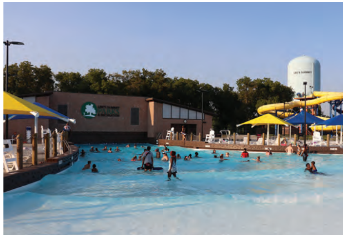
Summit Waves held its second Family Fun Night for 2021.