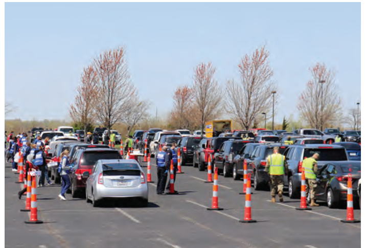
LSPR assisted a mass vaccination event at Legacy Park on Wednesday, April 14 & Thursday, April 15.