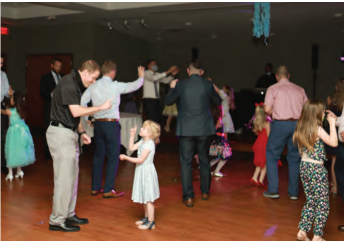
LSPR held Father/Daughter Dances at Gamber Community Center.