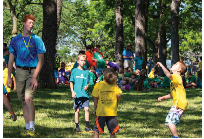
Staff is interviewing for seasonal positions at Camp Summit and Summit Waves.