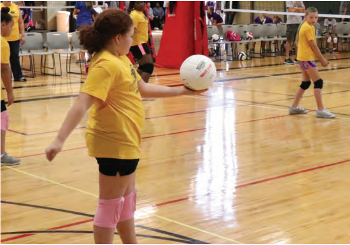
Girls Youth Volleyball began with 197 participants.