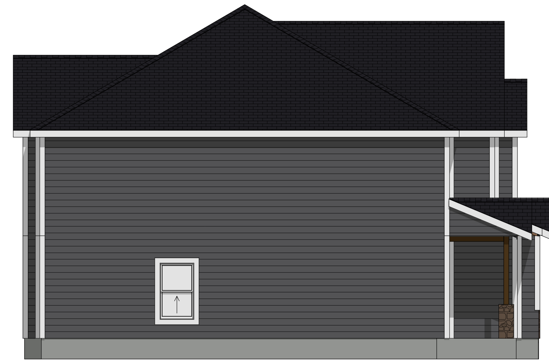
Exterior Elevation Side Scale 3/16" = 1'

SIDING & ACCENT COLORS TO BE ALTERNATED BY BUILDING