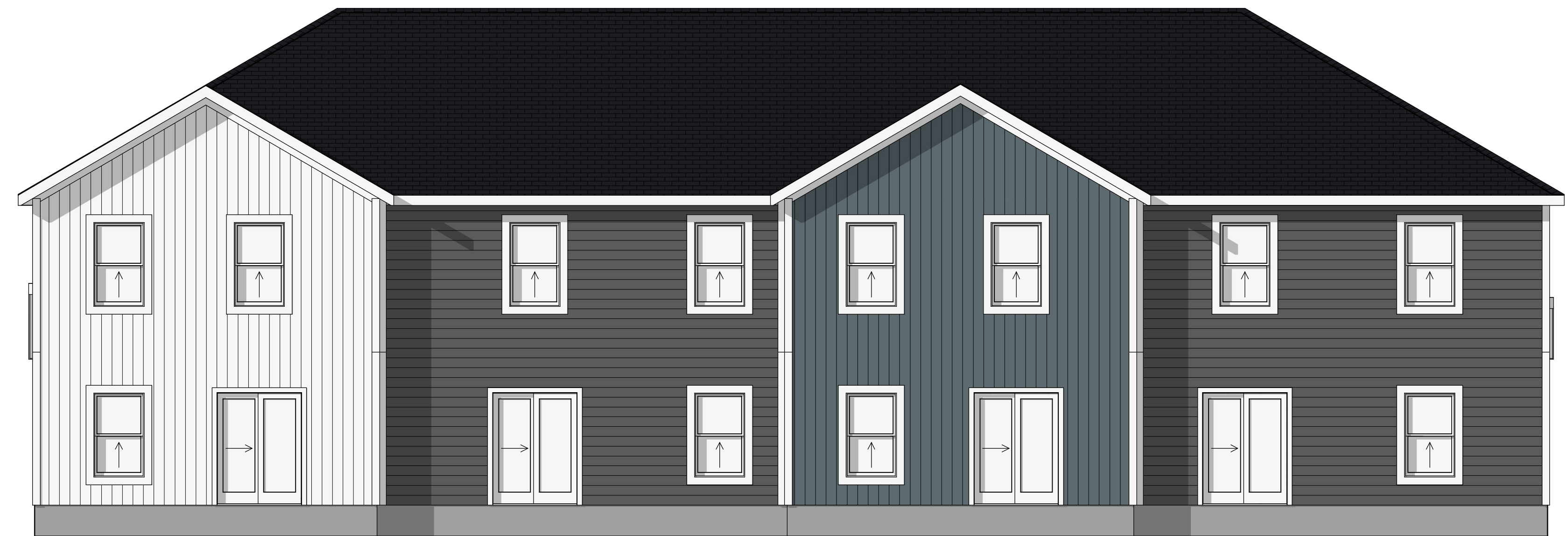
Exterior Elevation Rear Scale 3/16" = 1'