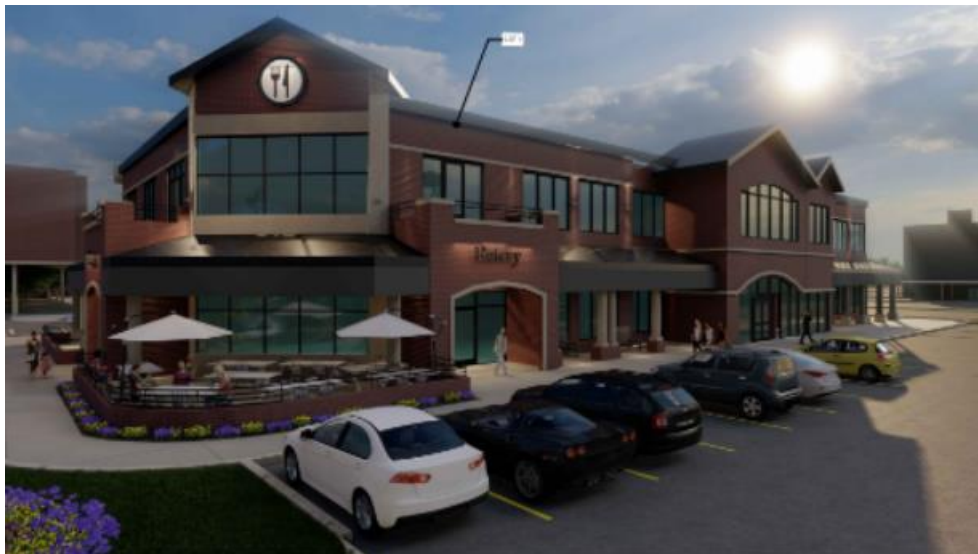
Figure 1 - Typical retail/office building

The proposed development is not expected to negatively affect the aesthetics of the subject project area and or neighboring properties. The developer has submitted design guidelines that will govern architecture and establish a cohesive theme that will carry through and complement future development of the property located south of NE Colbern Rd, north of I-470, east of NE Douglas St and west of NE Main St that will be considered in the future under separate application. Approved materials for the development include brick, cement fiberboard, aluminum and storefront glazing.