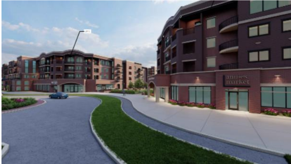
Figure 3 - Typical apartments over commercial