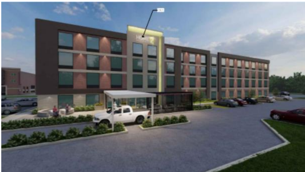
Figure 2 - Typical hotel