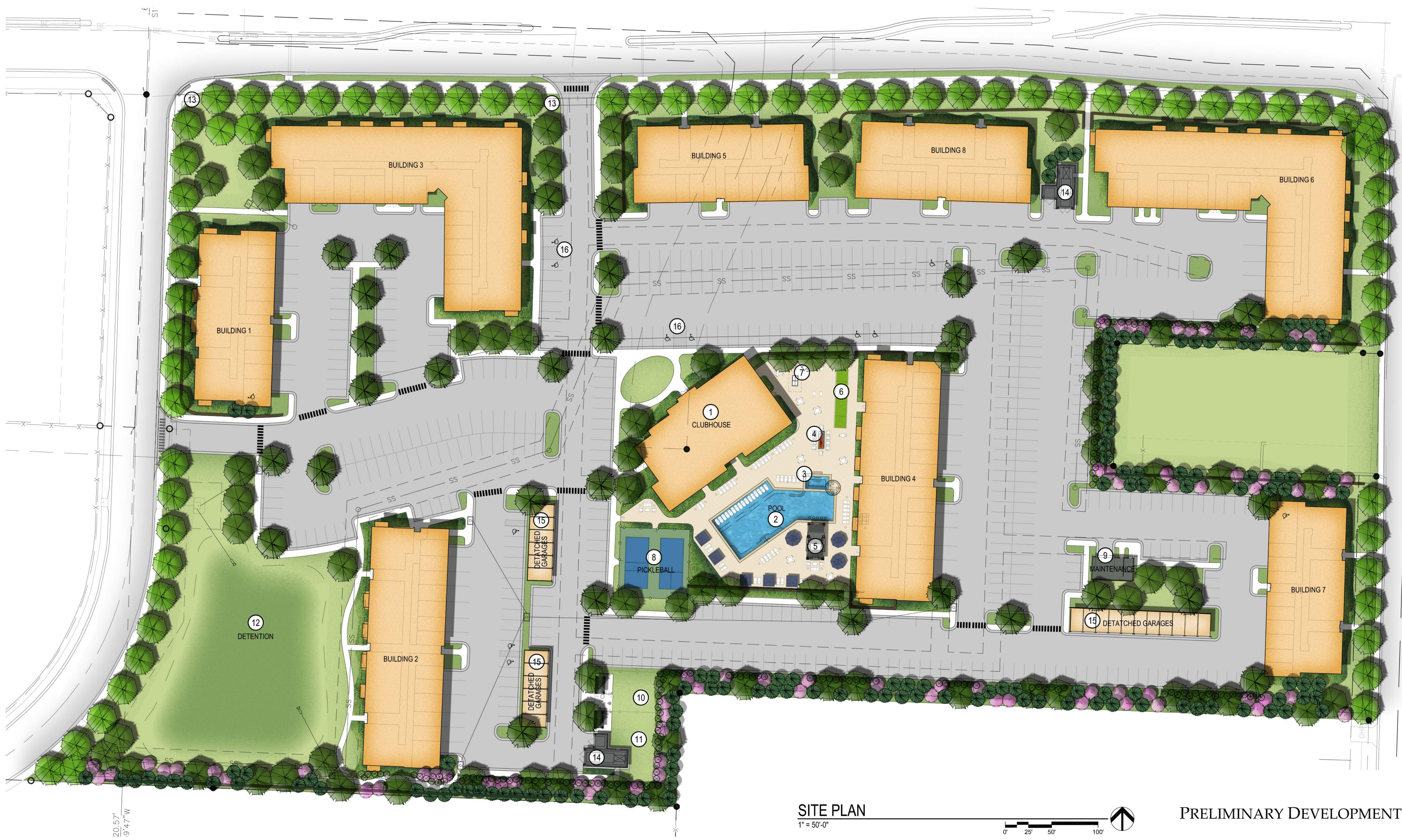
SITE PLAN 1" = 50'-0"