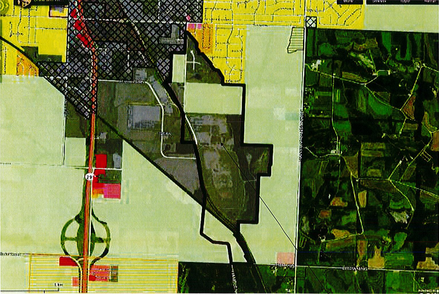
Expansion of US 50 / M-291 Highway LCRA Urban Renewal Area