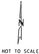
EXHIBIT A Contract Between MISSOURI HIGHWAYS AND TRANSPORTATION COMMISSION -and- CITY OF LEE'S SUMMIT, MISSOURI Job No. J4P2292 Jackson County