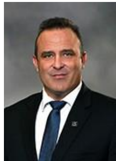
Mayor Bill Baird