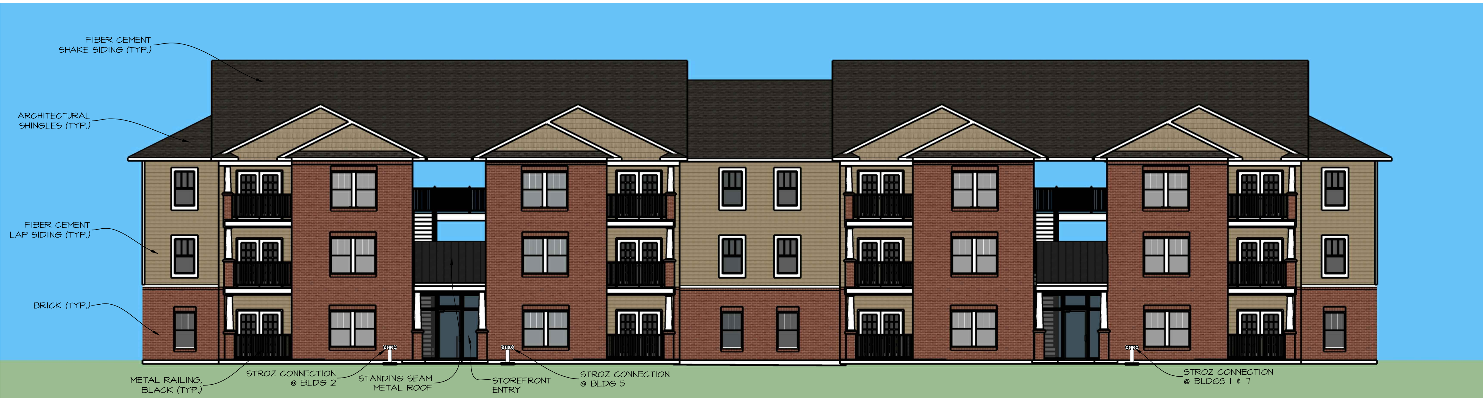
BUILDING "B" FRONT ELEVATION SCALE: 1/8" = 1'-0"

A PRELIMINARY NOT FOR CONSTRUCTION, RECORDING PURPOSES OR IMPLEMENTATION