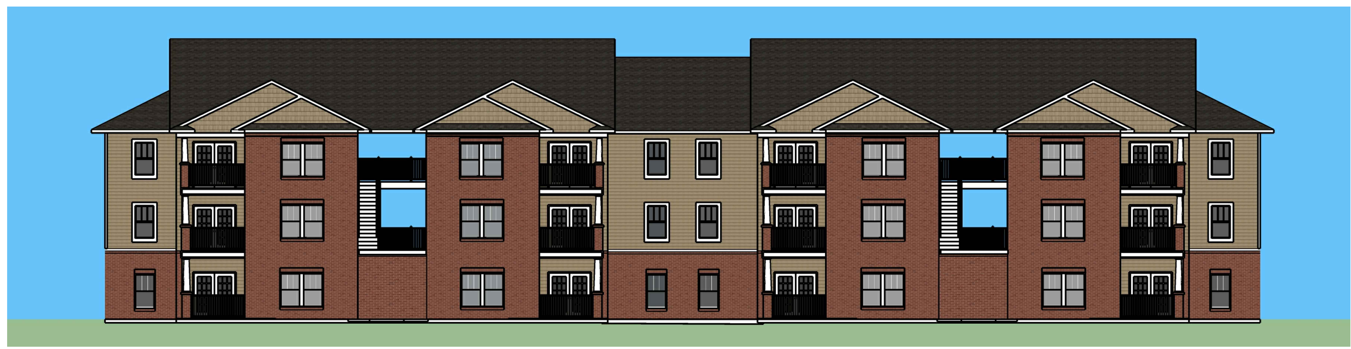
BUILDING "B" REAR ELEVATION SCALE: 1/8" = 1'-0"