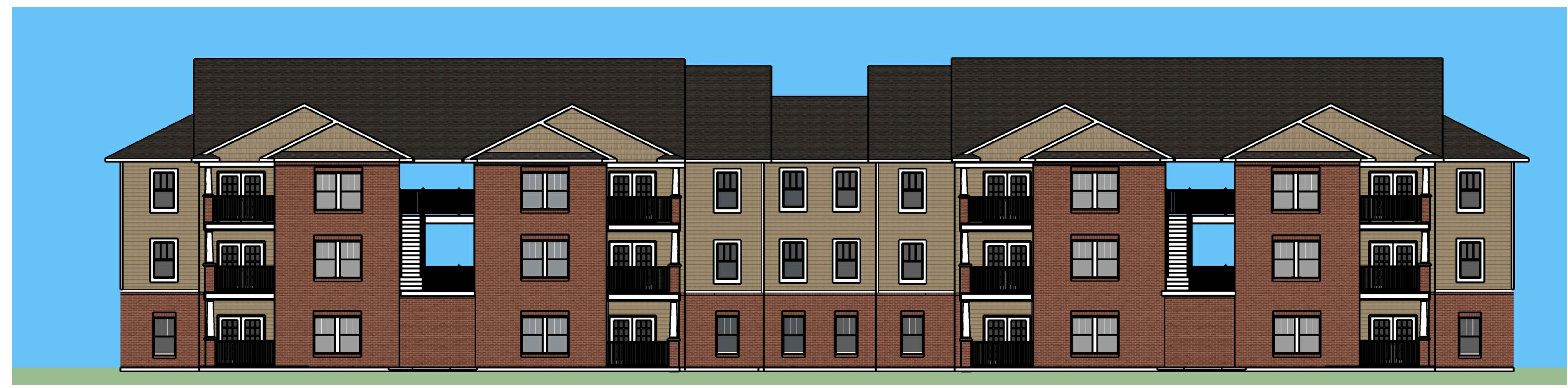
BUILDING "D" REAR ELEVATION SCALE: 1/8" = 1'-0"