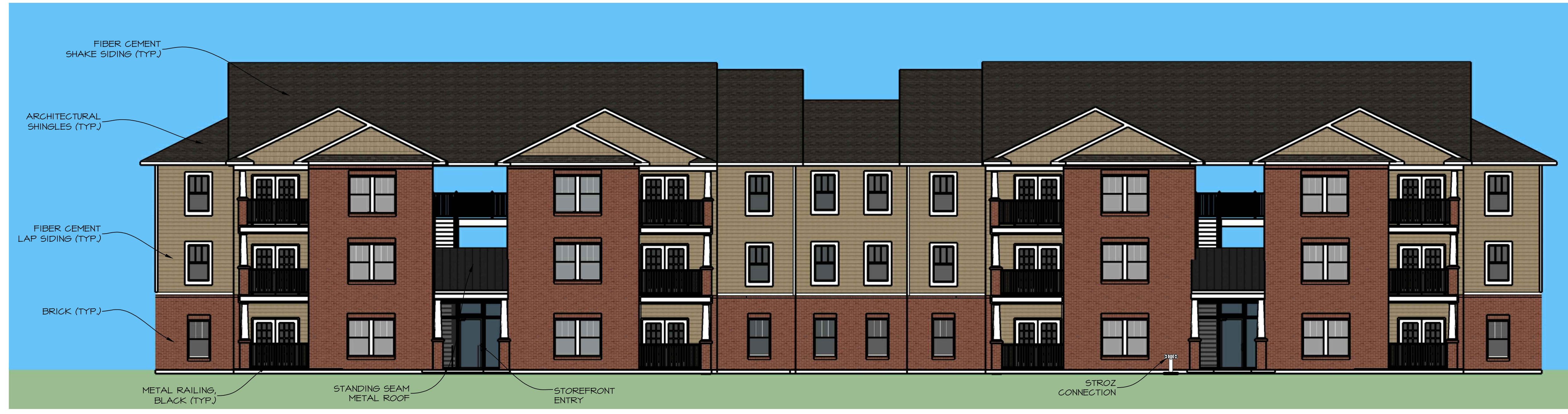
BUILDING "D" FRONT ELEVATION SCALE: 1/8" = 1'-0"

PRELIMINARY NOT FOR CONSTRUCTION, RECORDING PURPOSES OR IMPLEMENTATION