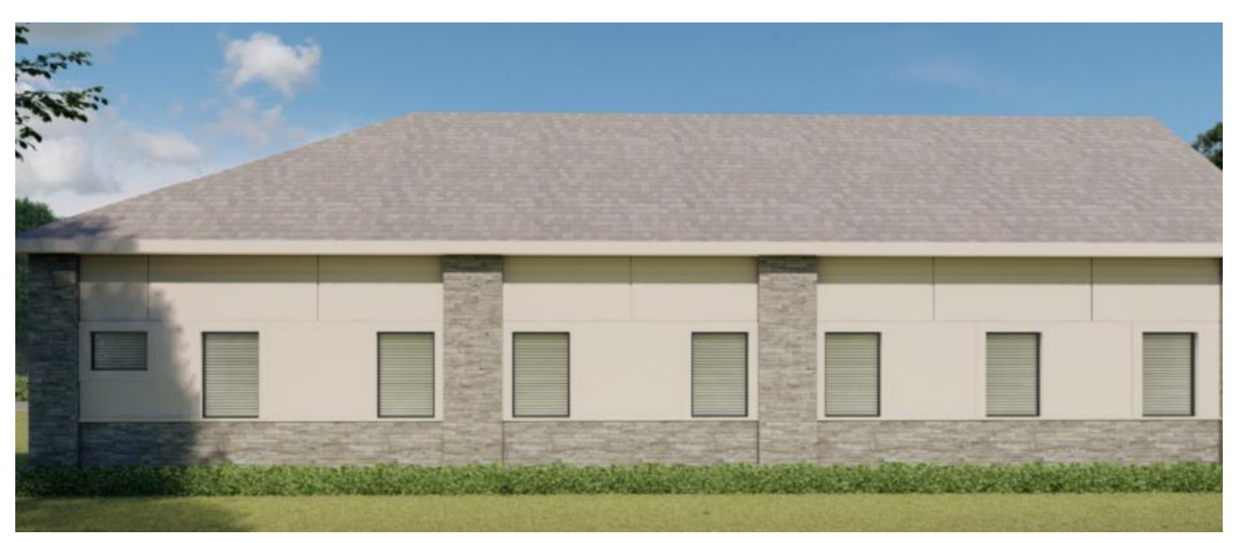
Figure\ 2-Rear\ building\ perspective