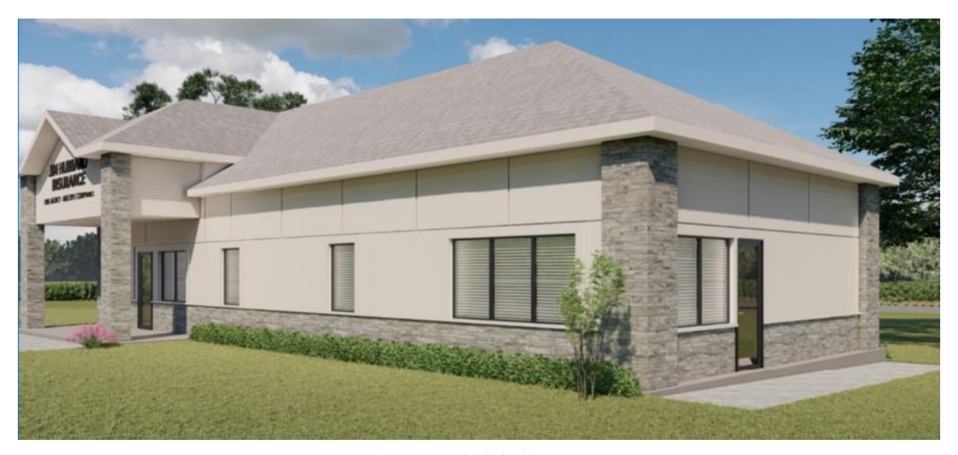
Figure 1 – Front and side building perspective