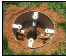
Installed concrete form with anchor bolts