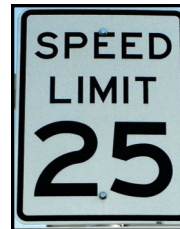
Regulatory speed limit sign