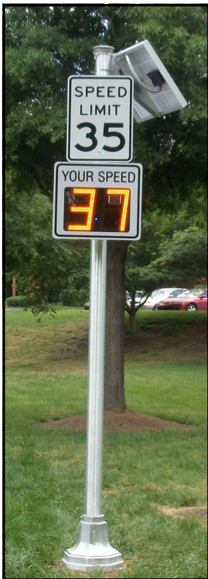
Installed Safety in a Box