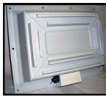
Sealed, powder-coated aluminum housing is vandal-resistant