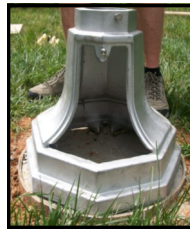
Breakaway pole base