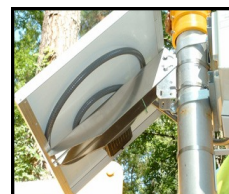
40 watt solar panel