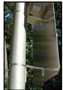
Installed regulatory speed limit sign using extender bracket set