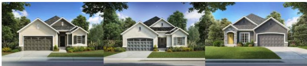
REPRESENTATIVE EXAMPLE ELVATIONS