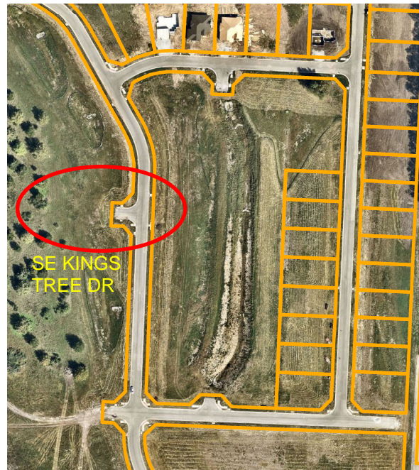
2022 AERIAL SHOWING NO AFFECTED PROPERTY OWNERS

SE JUD ROAD WAS PLATTED WITH COBEY CREEK 1ST PLAT. THE STREET ITSELF WAS NOT INTENDED TO BE CONSTRUCTED UNTIL COBEY CREEK 2ND PLAT. AN EXSITING STREET STUB WILL BE CONNECTED TO IN PHASE 2 CONSTRUCTION. A NEW DEVELOPER OWNS THE DEVELOPMENT AND WISHES TO RENAME "SE JUD ROAD" TO "SE KINGS TREE DRIVE". NO PROPERTY OWNERS WILL BE AFFECTED BY THE CHANGE.