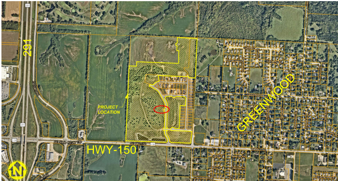
PORTION OF COBEY CREEK DEVELOPMENT PLANNED FOR 2ND PLAT