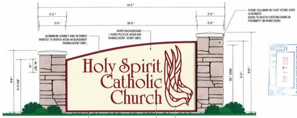
Figure 1- Specification of existing driveway monument signage along SW Arboridge Dr and SW Arborwalk Blvd.