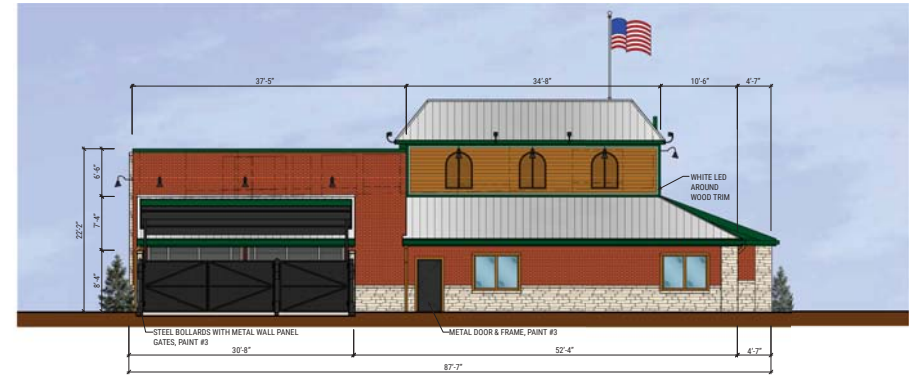
LEFT ELEVATION (NORTH)