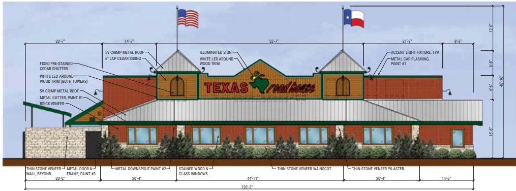
FRONT ELEVATION (WEST)