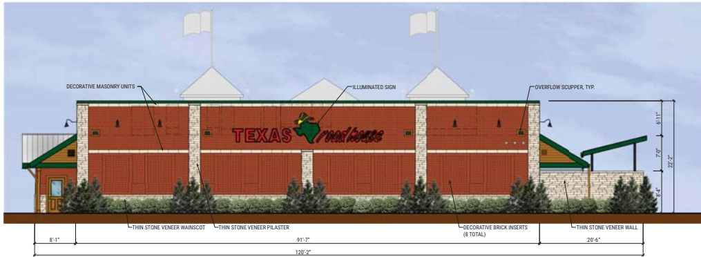
REAR ELEVATION (EAST)