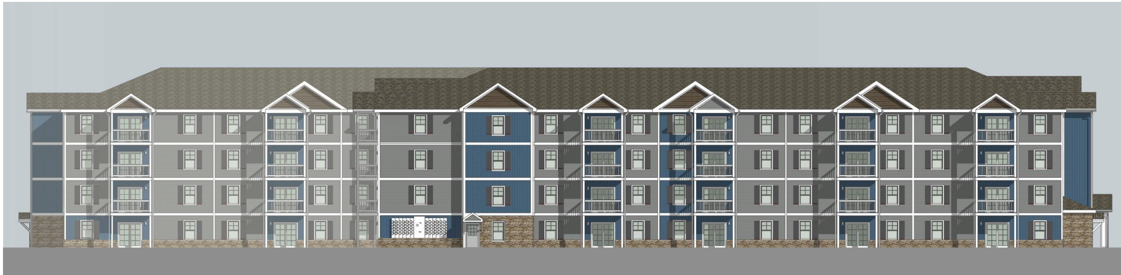
SOUTH ELEVATION SCALE 1/16"=1"