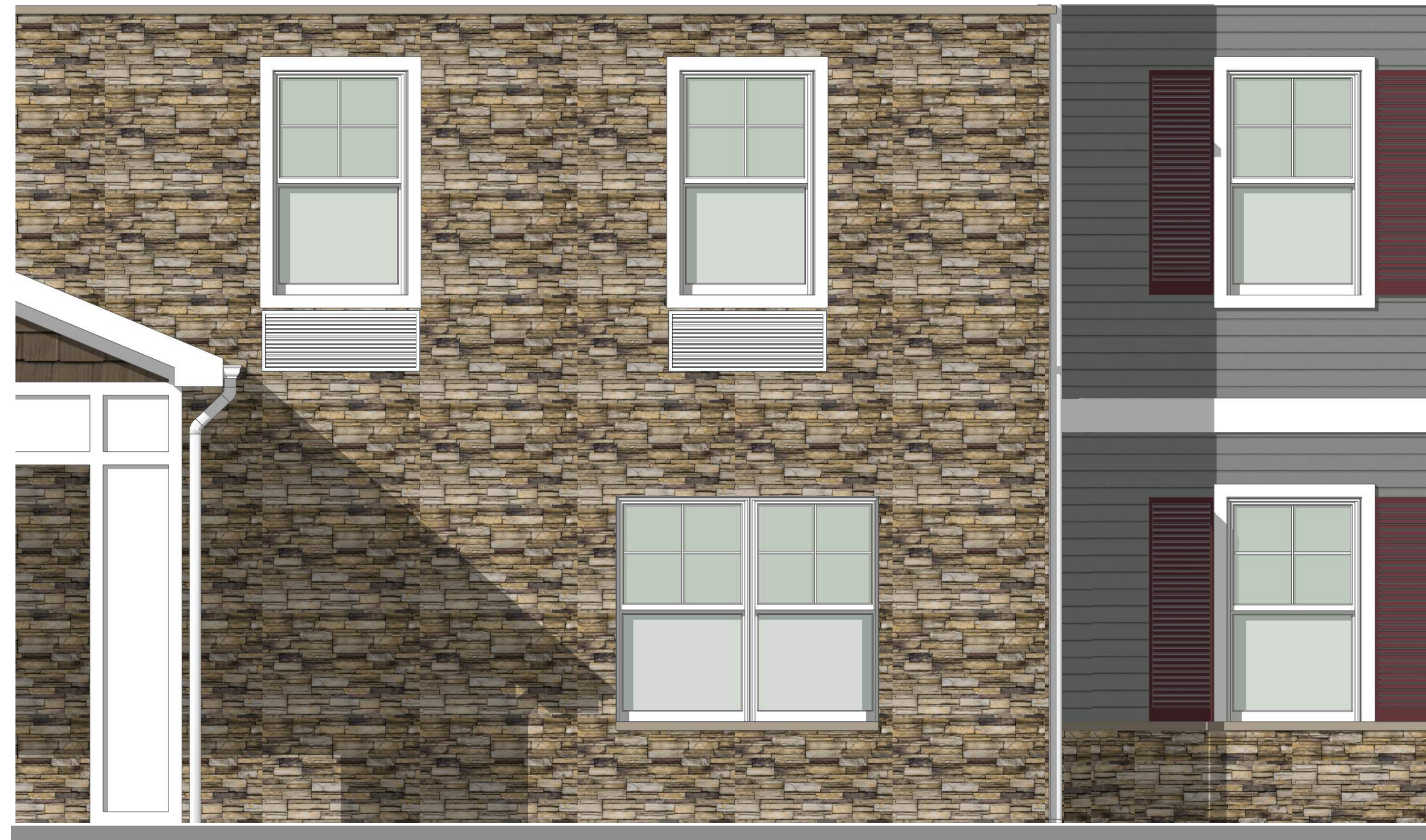
PARTIAL ENLARGE VIEW SCALE 1/2"=1"