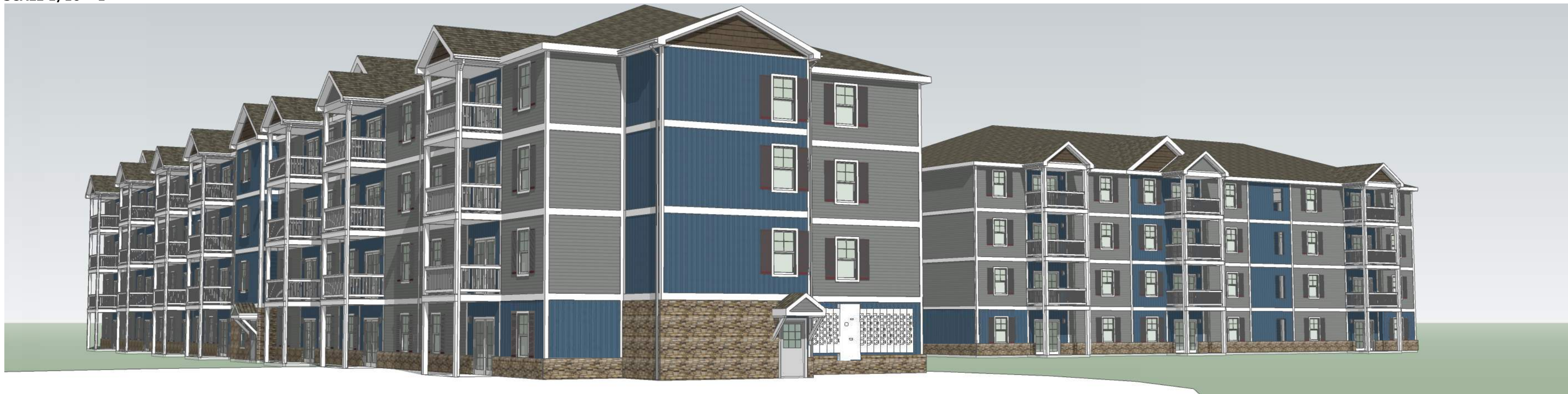
VIEW FROM SOUTHEAST