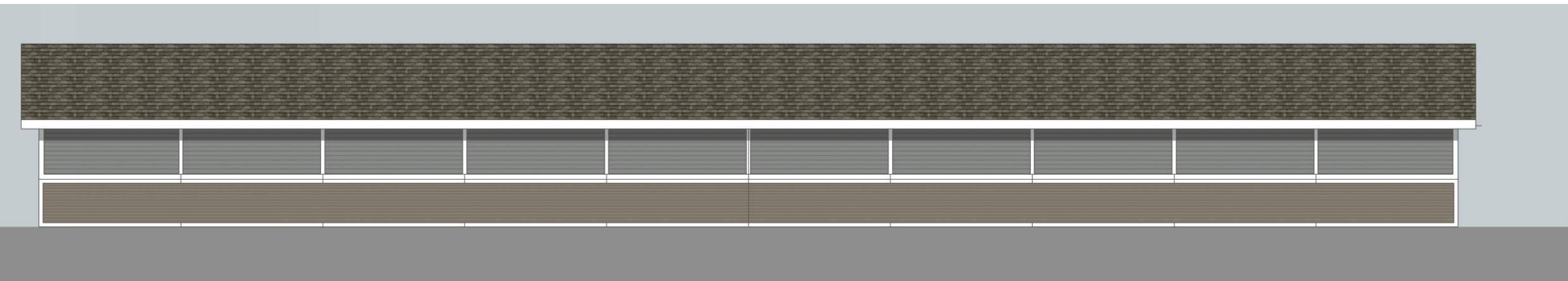
GARAGE REAR ELEVATION

NOTE: ELEVATIONS PROVIDED IS FOR A 10 CAR GARAGE ON SITE. OTHER GARAGES TO FOLLOW SAME EXTERIOR DETAIL AND FINISHES