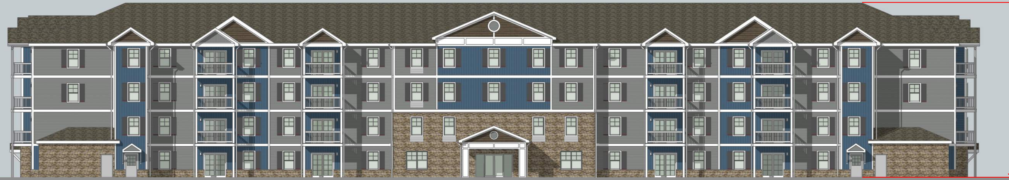
EAST ELEVATION (MAIN ENTRANCE)