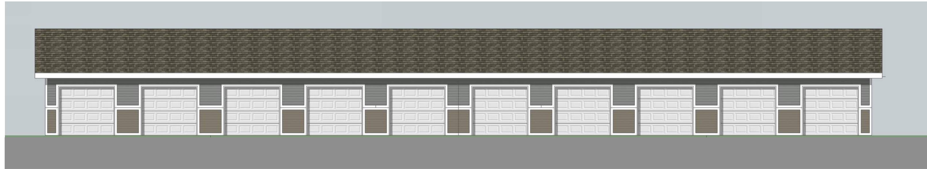
GARAGE FRONT ELEVATION