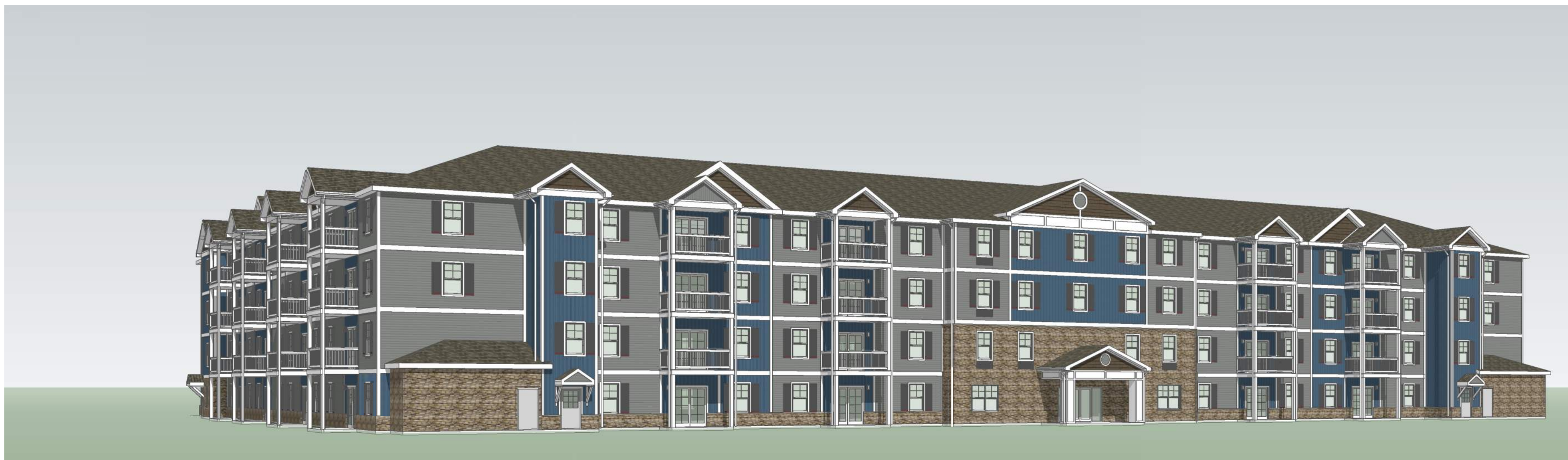
VIEW FROM NORTHWEST