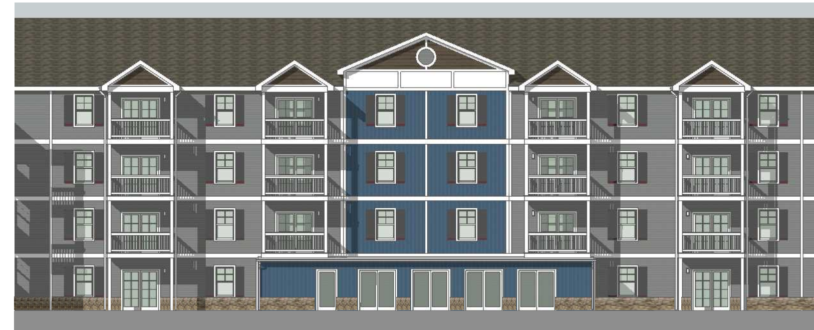
WEST CORE ENTRY VIEW SCALE 1/16"=1"