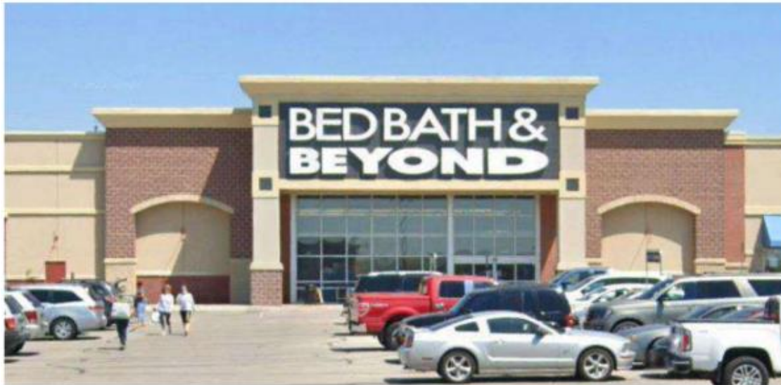
Previously installed sign