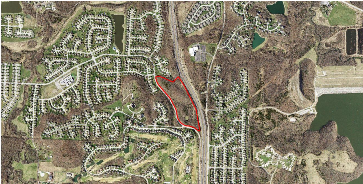
Figure 5 - 2020 Aerial photo