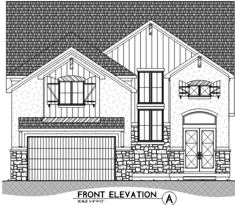
Figure 2 - 2 story single-family home