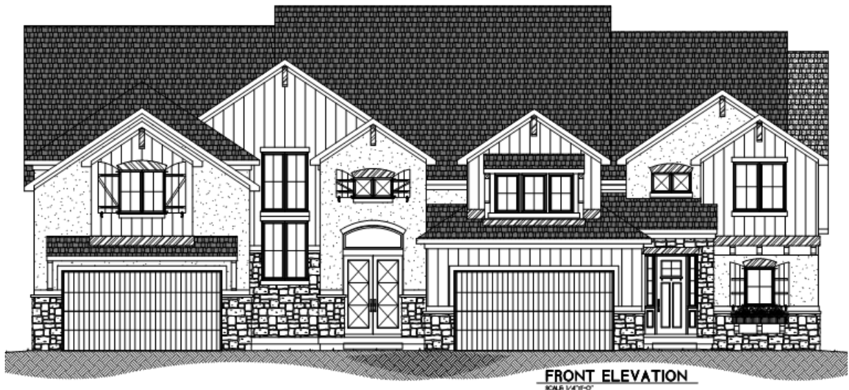
Figure 3 – duplex