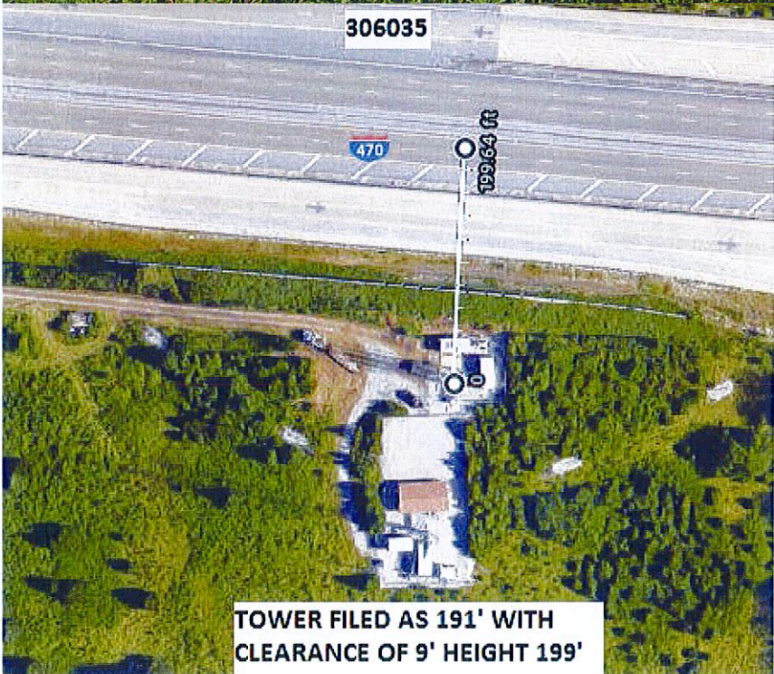
TOWER FILED AS 191' WITH CLEARANCE OF 9' HEIGHT 199'