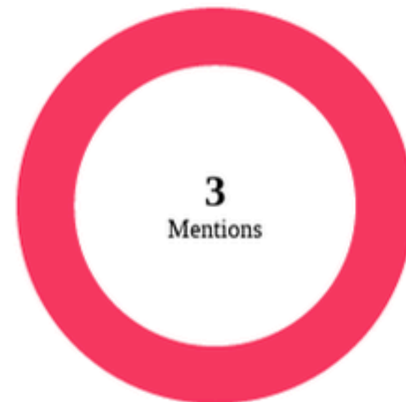
Mentions by Media Type