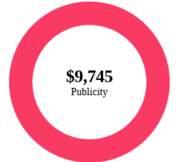
Publicity by Media Type