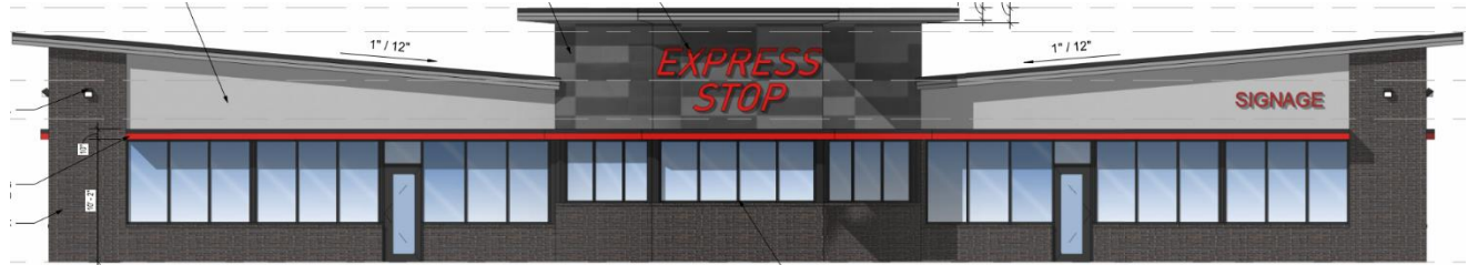
Figure 1 – South Elevation of the Proposed Building

The applicant is seeking approval of a preliminary development plan (PDP) to construct a 6,668 sq. ft. convenience store with fuel sales.