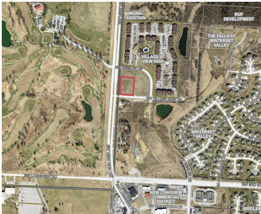
Figure 2 – Aerial of the surround property

The subject site is generally surrounded by undeveloped property to the north and east and is in the vicinity of the Village at View High apartments. The commercial component of the New Longview mixed use development is located approximately a quarter mile south. The Fred Arbabas Golf Course is located west of the property.