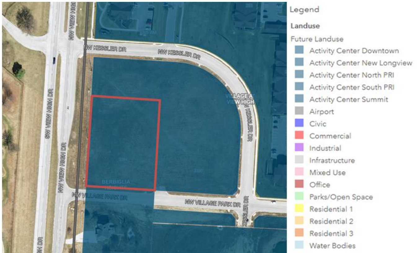
Figure 1 - Comprehensive Plan future land use map

The proposed uses are consistent with the New Longview Activity Center land use designation under the Ignite Comprehensive Plan. The Activity Center includes a range of commercial, industrial and residential options. An objective established in the Comprehensive Plan is to stimulate continued economic development investment by the private sector. The subject application meets this goal by developing a long vacant property in Lee’s Summit.