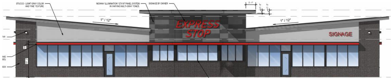
Figure 3 –Front elevation

The proposed building materials utilized in the design of the proposed convenience store and gas station include a combination of EIFS, brick, Nichiha and glass. The proposed building materials are compatible with the design and construction of existing commercial and industrial buildings in the surrounding developments and throughout the community.