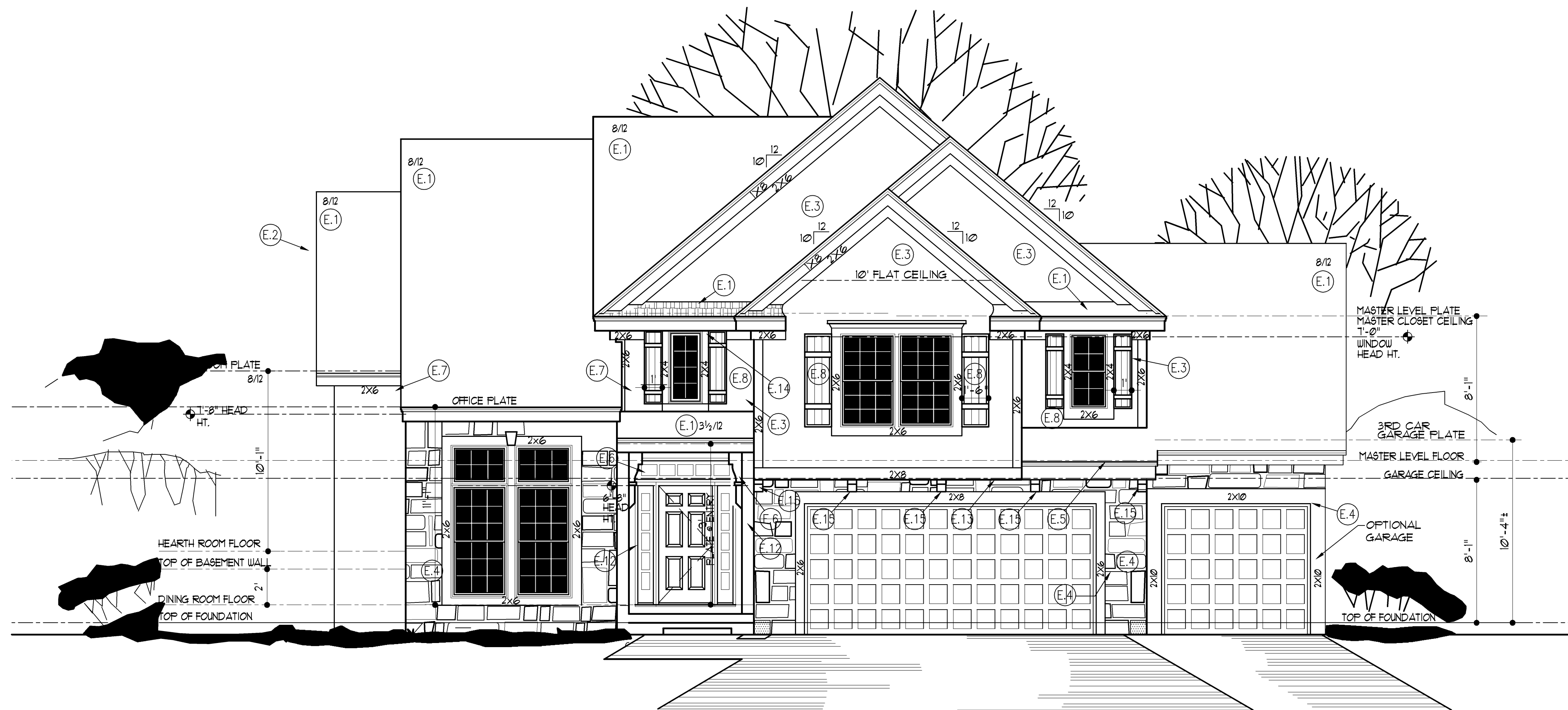
1 FRONT ELEVATION 1/4" = 1'-0"