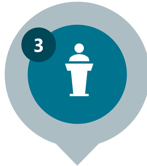
Community Speaking Events