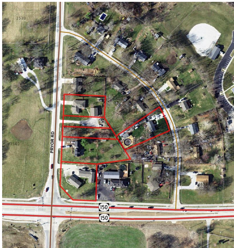
Figure 2. Aerial View

The subject properties are within the Grand Summit View neighborhood, and the existing dwellings take access from SW Pryor Rd and SW Crane Rd. The neighborhood is built out except for Lot 1, which has a utility transformer along the southern half of the frontage; the northern half is used as a gravel drive for the northern adjacent Lot 20. The topography of the neighborhood slopes downward towards the southwestern boundary, with a change in elevation of almost 20 feet.