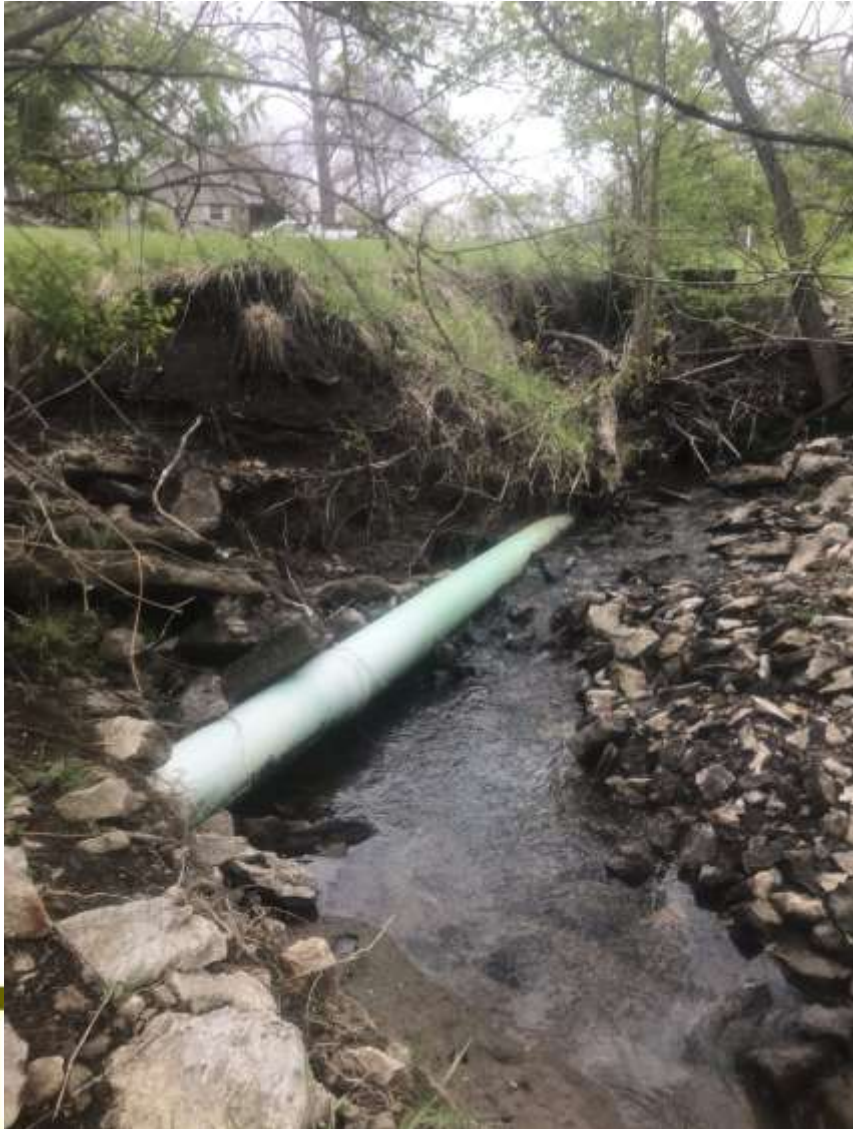
Exposed Sewer Main

Toe (bottom) of slope erode by stormwater flows along outside bend of a stream