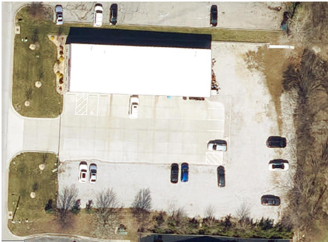
Figure 3. Aerial showing existing conditions

The subject property at 1231 SE Century Dr is developed with an approximately 4,370-sf. single-story building. The eastern rear and southernmost 1/3 of the property are graveled and used for vehicle parking and storage. The site is served by a single driveway to the west from SE Century Dr.