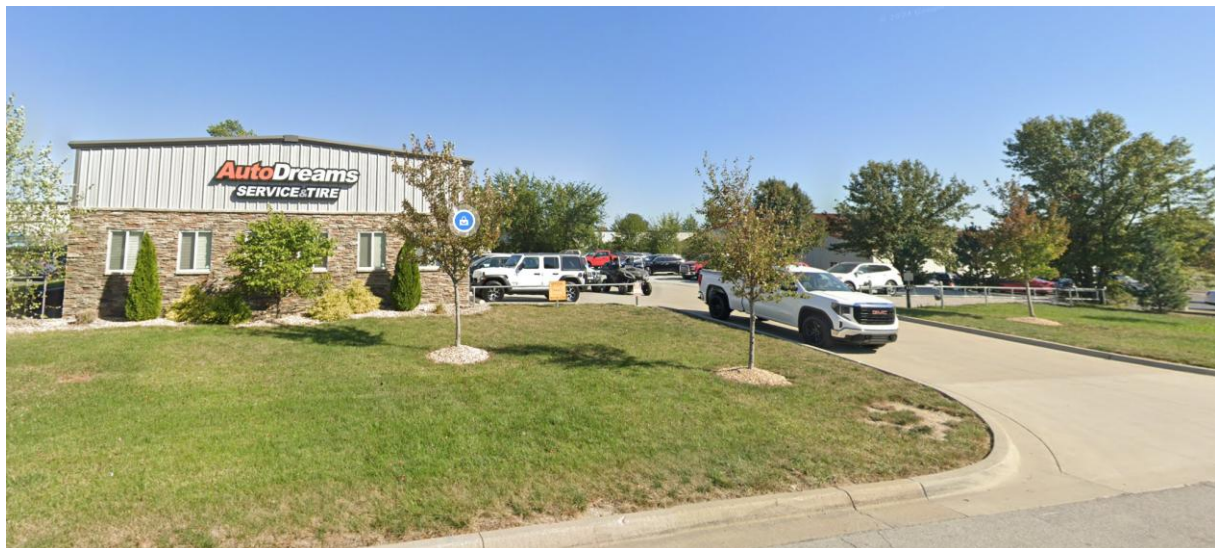
Figure 1 - Front view of existing facility.

The subject 0.79-acre property is the site of the existing AutoDreams Service and Tire. The applicant uses the site for automotive sales and major automotive repair. The building was constructed in 2015 with a pre-engineered metal wall panel system.