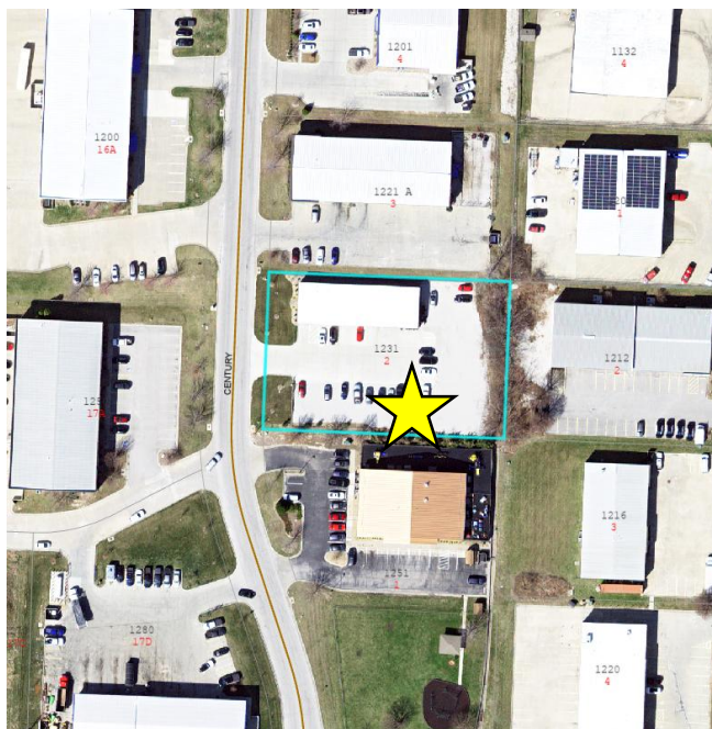
Figure 2 - Area map showing subject property (outlined in blue)

The subject property is located along SE Century Dr., southwest of Highway M-291 and US Highway 50. The properties surrounding the site are primarily industrial and include the Eastside Business Park and the 50 Highway Office Park. The parcel directly south of the site is a daycare center zoned CP-1 (Planned Neighborhood Commercial).