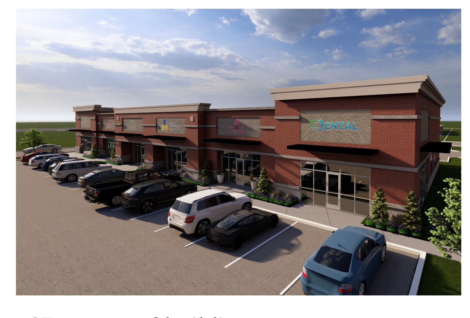
SE corner of building Single Story Retail Buildings