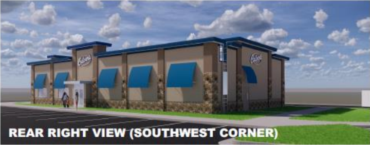
REAR RIGHT VIEW (SOUTHWEST CORNER)