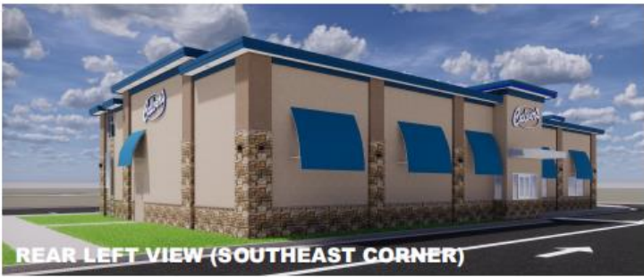
REAR LEFT VIEW (SOUTHEAST CORNER)