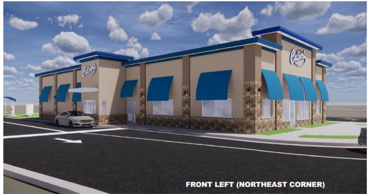
FRONT LEFT (NORTHEAST CORNER)