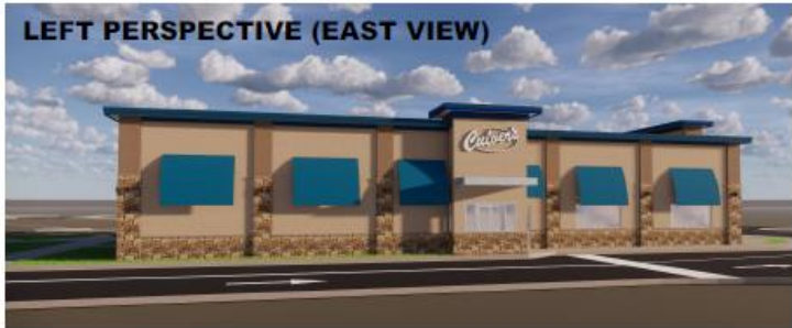
LEFT PERSPECTIVE (EAST VIEW)