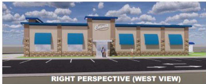
RIGHT PERSPECTIVE (WEST VIEW)