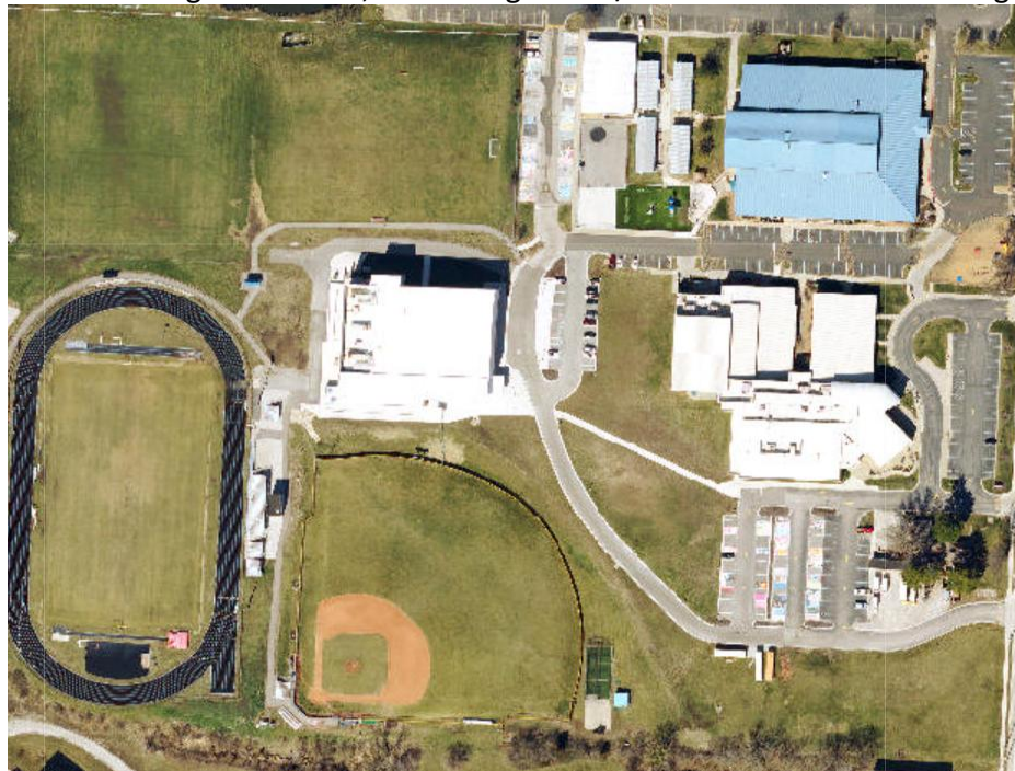
Figure 1 – Aerial view of Summit Christian Academy.

The subject 29.53-acre property is the site of Summit Christian Academy. The property currently consists of an elementary school, secondary school facility, four (4) modular classrooms, a detached indoor gym with an existing soccer field, an existing soccer/football field and an existing baseball field.