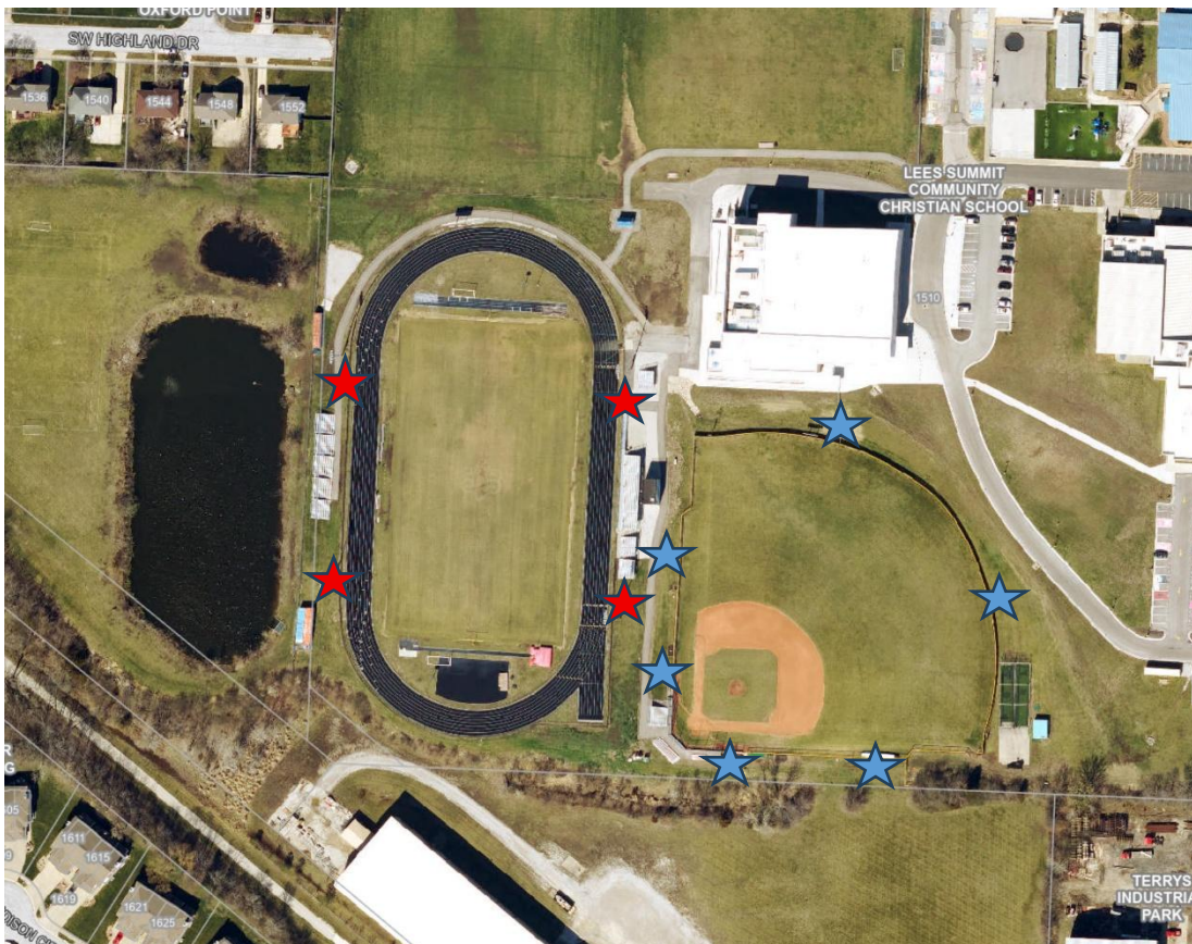
Figure 3 - Area map showing existing (red) and proposed (blue) lights.

The applicant seeks approval of an SUP to allow the continued operation of the existing field lights for a period of 20 years on the subject property. After approval of the original Special Use Permit (Appl. #PL2016-030) the applicant only installed four (4) lights on the football/soccer field. The applicant requests the Special Use Permit to allow the future installation of lights on the baseball field but has no immediate plans to do so at this time.