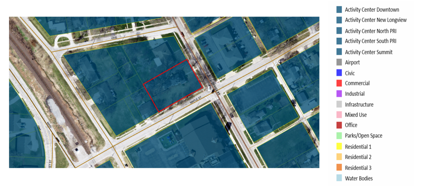
Figure 4 – Future Land Use Map & Legend

The Ignite! Comprehensive Plan promotes various strategies to build long-term economic prosperity and resiliency in the City's economy. One objective established in the Comprehensive Plan is to increase business retention and grow business activity. Also, the future land use plan within the Ignite! Comprehensive Plan denotes the subject property as part of the Downtown Activity Center which states office uses as complementary. Approval of the subject Rezoning and PDP applications to allow a business office on the subject property supports continued economic viability of the site by growing business activity.