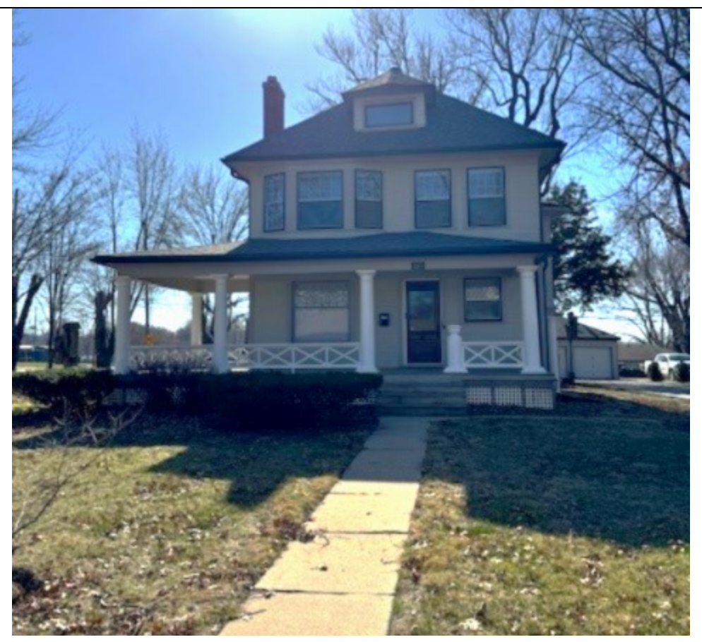
Figure 1 – Existing single-family house