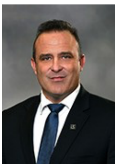
Mayor Bill Baird