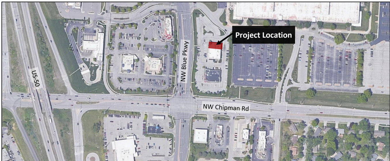
Figure 1 – Project Location

Renaissance Infrastructure Consulting (RIC) has completed a trip generation analysis for a proposed Coffee Shop located north of Chipman Road and east of Blue Parkway in Lee's Summit, Missouri. The purpose of this analysis is to compare the trip generation estimates for the proposed development and the existing land use. A 1,500 square foot Coffee Shop with Drive-Through is proposed to replace what was previously an Ice Cream Shop. The existing shops/restaurants on the south side of the building are not proposed to be changed.