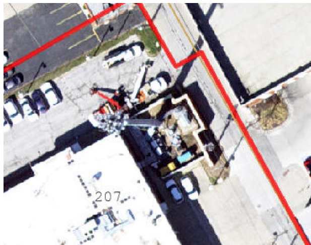
Figure 3 – Aerial of the subject tower site within the property.